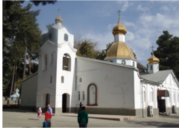
Russian Orthodox St. Nicholas Church, Dushanbe

in the remote mountainous terrain of the Gorno-Badakhshan Autonomous Region in eastern Tajikistan. 1, 2 The remaining 10% of the population are Christians, Baha'is, Jehovah Witnesses, and Jews. Christians make up the largest non-Muslim groups. 3, 4, 5 Of the approximately 150,000 Christians, Russian Orthodox constitute the largest group. 6 Baha'is have been in Tajikistan since the early 20th century, but face government opposition. 7 Most of Tajikistan's Jewish population, divided between Bukharan and Ashkenazi Jews, fled the country during the civil war; today, there are fewer than 300 Jews in Tajikistan. 8