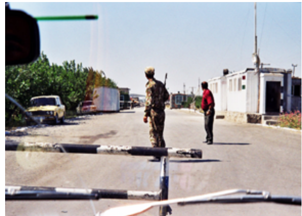
Tajikistan-Uzbekistan border

Tajikistan is a landlocked country that shares borders with four countries: Afghanistan, China, Kyrgyzstan, and Uzbekistan. Cultural differences, poverty, crime, natural disasters and long-term international conflicts necessitate numerous armed guards in military checkpoints and border crossings. Some border crossings can be closed without notice so checking the weather and planning ahead is advisable. It is advisable to find out which border crossings are closed to foreigners as well. 45