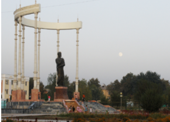
Rudaki in Qurghonteppa

Qurghonteppa, formerly known as Kurgan-Tyube, is the third largest city in Tajikistan. The city lies in the Vakhsh River valley about 100 km (62 mi) south of Dushanbe. The city's economy relies on agriculture and animal husbandry, mostly cotton and sheep, and is home to food processing plants and textile manufacturers, a medical school, and a power engineering technical college. 55