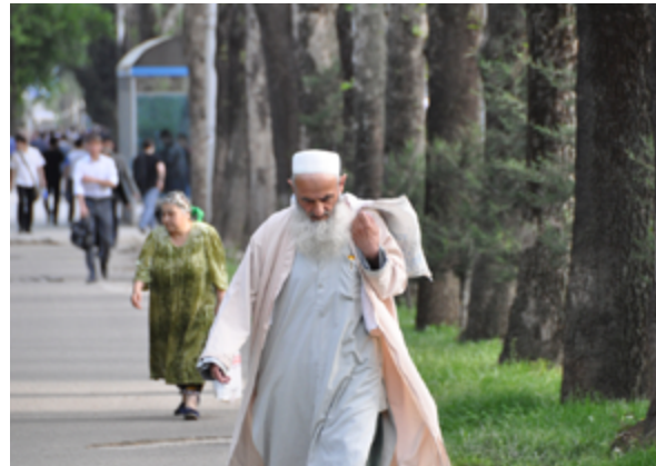
An elderly man walking

Elders receive respect from their children and a place of honor in the family. In rural areas, elders finalize family decisions, which are considered binding. Grandparents often help care for their grandchildren, passing along their knowledge and teaching them culturally appropriate behaviors. Grandmothers teach their granddaughters female social traditions, while grandfathers teach their grandsons male social traditions. Respected male village and neighborhood elders hold local positions of authority and governance. 18, 19, 20