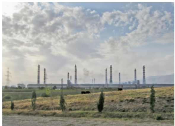
TadAZ aluminium smelting plant, Tursunzoda

Tajikistan has the highest poverty rates of any post-Soviet country, and remains the poorest nation in Central Asia. 82 More than 70% of the nation's population relies on subsistence farming. The agriculture sector employs almost 50% of the population and generates approximately 30% of GDP (Gross Domestic Product). 83 Cotton is the most important commercial crop, which the Tajik government closely monitors and controls. Although Tajikistan has numerous natural resources, industrial output remains low. Gold, uranium, tungsten, and silver are largely unexploited. Industrial output is restricted to aluminum. 84, 85 Hydroelectric power production also plays a role in the nation's economy. The government is currently trying to achieve food self-sufficiency, but growth has been slow. As many as 50,000 people migrate yearly