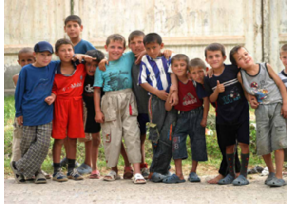
Young Tajik boys

Circumcision is a rite of passage for Tajik boys. At the age of five, an elaborate ceremony is conducted at which a local religious leader performs the circumcision. However, some parents wait until their son is around the age of 14 so they have enough time to save money for the celebration. Tajik females are considered adults once they start menstruating, while sexual maturity defines adulthood for males. Eighteen is the legal age of adulthood in Tajikistan. A young female is not considered a woman, however, until she has given birth. 42, 43, 44