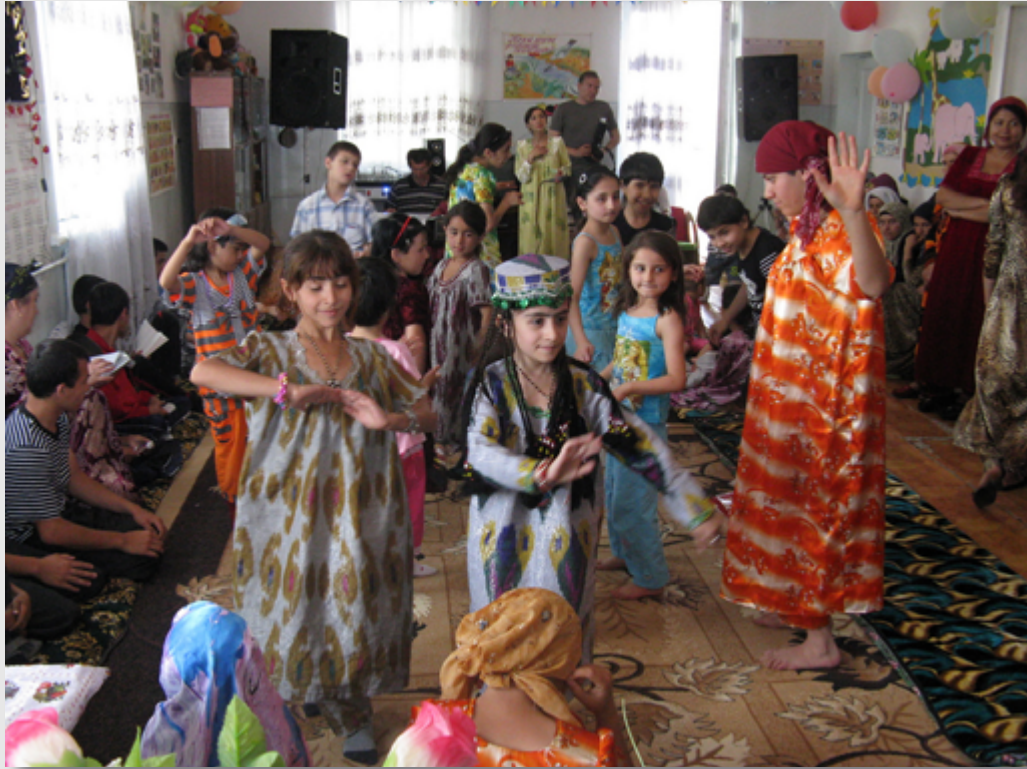
Tajik children dancing