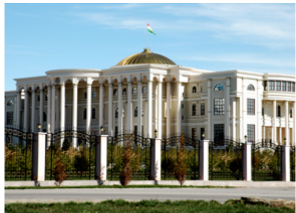
The Palace of Nations in Dushanbe

The legislative branch is the Supreme Assembly. It consists of two houses: The Assembly of Representatives and the National Assembly. The Assembly of Representatives meets year round and has 63 seats. Members are elected to serve 5-year terms; 41 representatives are chosen by direct popular vote and 22 are elected by the party. The National Assembly has 33 seats. Because the constitution provides equal representation, three-fourths of the assembly members are chosen by councils representing the four political regions of the country: Dushanbe, Khujand, Qurghonteppa and Khorugh). The remaining members are appointed by the president. The National Assembly meets at least twice a year. 70, 71, 72, 73