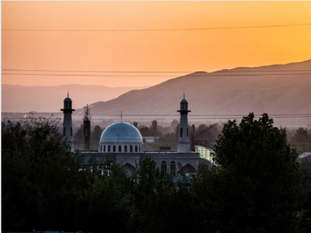
Tajik sunset