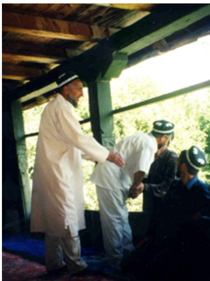
Tajik men greeting guests

Tajik men typically greet each other by shaking their right hands, often placing their right hand over their hearts before or after the handshake. Women usually greet other women with a handshake and nod of the head. Rural men and women do not touch in public. Consequently, rural men typically greet women in public by offering a nod of acknowledgement or a verbal greeting. Conversely, urban men and women may greet each other with a handshake, but women should initiate the handshake. 16, 17