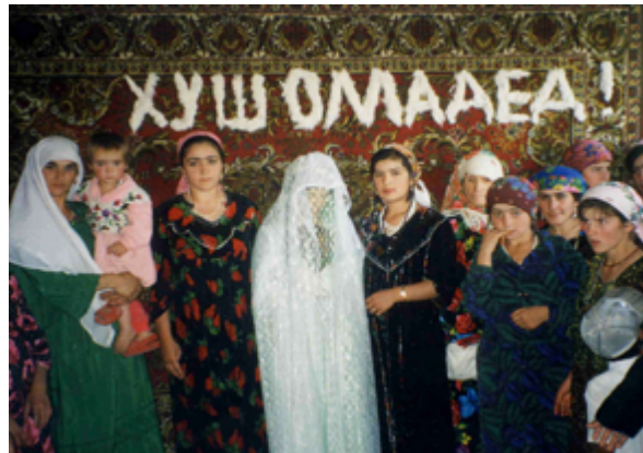
Tajik wedding

Weddings are elaborate affairs that last up to seven days. They begin with separate banquets for the bride and groom that last for three days. On the fifth day, friends and family of the groom accompany him to the bride's house, where the two take their oaths before an imam. At this point, the marriage is complete. Singing and dancing take place until the bride's family comes to spend the night at the groom's home. The purity of the bride is of the utmost importance. She must prove her purity to her mother-in-law after the conjugal night. Weddings are costly, and many people in Tajikistan have to save for years to pay for them or be forced into serious debt. As a result, in 2007 President Emomali Rahmon introduced new legislation that puts limits on the cost of weddings and the number of guests that can be invited to the festivities. 37, 38, 39