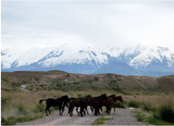
Pamir Mountains FEMEN #JeSuisCharlie

activity in the region causes frequent earthquakes, floods and landslides that injure and kill people and damage the poor infrastructure. 11