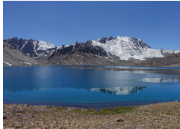
Landscape of Tajikistan

Tajikistan is a small, landlocked, mountainous country located in Central Asia. Its total land area equals 144,100 sq km (55,251 sq mi), making it slightly smaller than Wisconsin. Approximately 2,590 sq km (1,000 sq mi) is water. Tajikistan shares borders with China to the east (414 km/257 mi), Kyrgyzstan to the north (870 km/541 mi), Afghanistan to the south (1,206 km/749 mi), and Uzbekistan to the west (1,161 km/721 mi). 5, 6