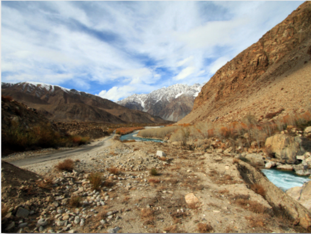
Pamir Mountains