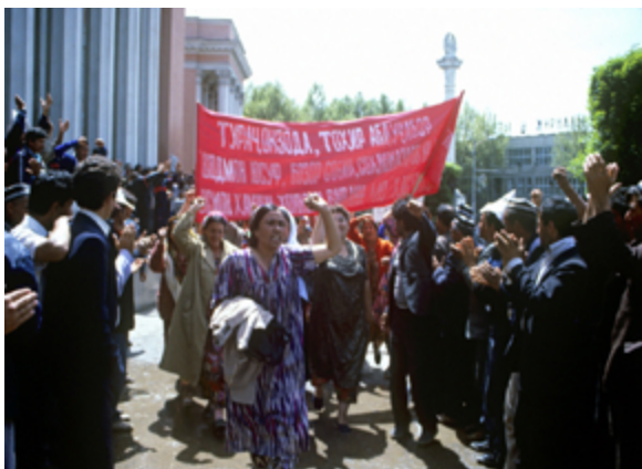
Tajiks rallying shortly after independence, 1992

Today's Tajiks are descended from the diverse groups of Iranians who lived in the Central Asian Tajikistan region for more than 2500 years. The area was conquered by Alexander the Great during the fourth century B.C.E. 56 By the third century, Zoroastrianism became the dominant religion and the Persian language and culture spread even further across the region. Islam arrived in the eighth century with the conquering Arabs and 100 years later became the dominant religion. 57 A number of successive invasions led by the Turks, Mongols, and Uzbeks between the 11th and 16th centuries resulted in the Uzbeks dividing the area of modern-day Tajikistan into a series of khanates. The Uzbeks continued to rule this area until the mid-19th century, when the Russians instituted cotton cultivation and began taking control of the region's economy. 58, 59, 60