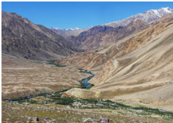
Gunt valley between Bachor & Yashilkul

Only 7% of Tajikistan's land area are designated as valley zones. There are two valley zones: The Fergana Valley of the northwest and the river valleys of the southwest. The valleys are important for water distribution, agriculture, and hydroelectric power production. The valleys are the most densely populated areas of the country. 14 Cotton, fruit, and raw silk production are crucial to the economic security of the region. The Syr Darya River and Kairakum Reservoir are