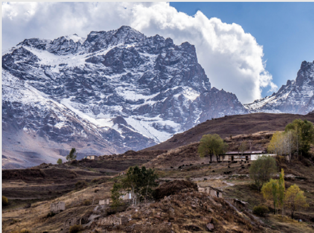
A small village in the Yagnob Valley, Northern Tajikistan