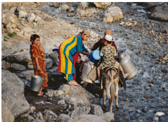
Rural village life

Mahallas make decisions concerning the resolution of disputes among family members and neighbors; they decide on marriages, divorces, and other family issues. They also organize public works and services, such as the building and repair of irrigation systems, the building of schools and other public and religious structures, and the care of widows and the elderly. Issues involving agriculture, herding, grazing, and water access are all