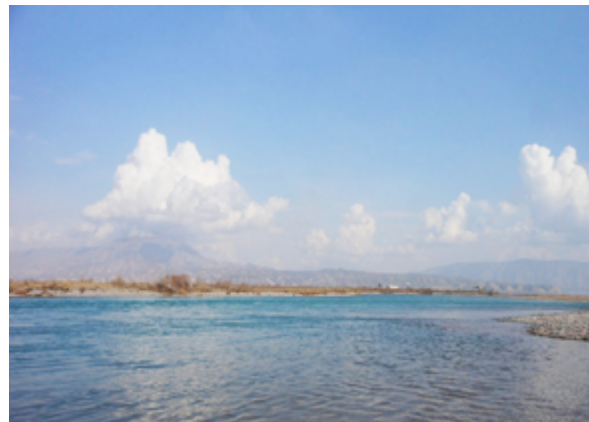
Vakhsh River

The Amu Darya, located in southwestern Tajikistan, is also very important to the nation's survival. 25 Formed by the confluence of the Panj and Vakhsh rivers, the Amu Darya drains an enormous amount of water on its way to the Aral Sea, creating irrigation for agriculture and hydroelectricity. 26 The Amu Darya, the longest river in Central Asia, reacts delicately to changes in precipitation and glacier ice melt. 27, 28