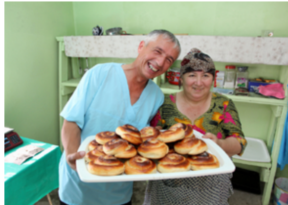
Sharing pastries

Over 80% of Tajiks live below the poverty line and food is scarce. 7 Yet, hospitality and generosity continue to be important values in Tajik culture. Gift-giving is common in Tajikistan. 8 Lipioshka (bread) is very important to Tajiks, and a meal is never eaten without it. Lipioshka is considered a sacred symbol of life and is treated respectfully. It is taboo to place bread face down, and leftover bread or nan crumbs are used to feed animals. 9, 10, 11 Since Tajikistan is a predominately Muslim country, eating pork is taboo. 12, 13, 14, 15