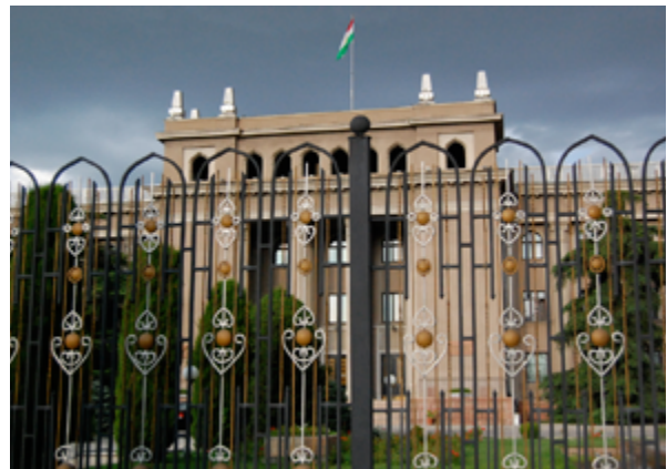
Government building

In 2012, the United States Commission on International Religious Freedom designated Tajikistan a country of particular concern (CPC). Although Tajikistan's constitution provides for freedom of religion, and the country has no official religion, the government flagrantly violates citizens' right to religious freedom. 28 Religious organizations must register with the government to receive legal status. Failure to receive legal status forces religious organizations to operate illegally, and their clergy and practitioners face fines and incarceration. In 2011, the government created the Law on Parental Responsibility for Educating and Raising Children. This law makes it illegal for children under the age of 18 to receive religious training and instruction outside of government-run schools. Sending people abroad to receive religious instruction is also illegal. 29, 30, 31, 32