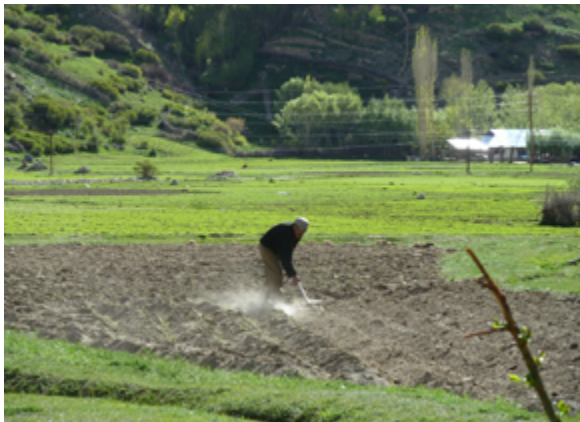
A farmer working

Approximately 74% of the Tajik population lives in rural areas. Because agricultural land is scarce and agricultural output is considered crucial to the nation’s survival, the vast majority of Tajikistan’s limited agricultural resources belongs to the state. When the Soviet era ended in 1991, the Tajik government gave unused and underutilized farmland in the Pamir Mountain Region to Tajiks who were willing to become farmers. Limited access to pasture and farmlands, severe weather conditions, mountainous