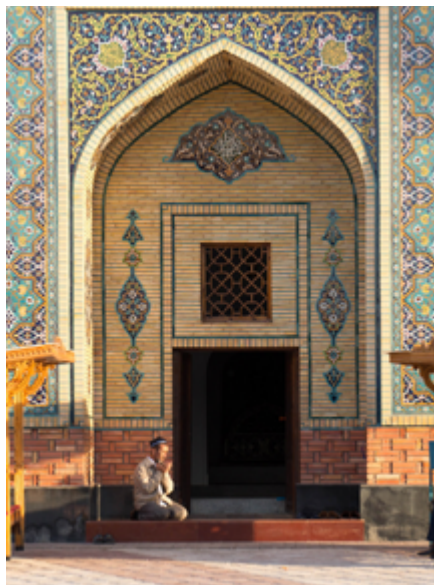
Morning prayer at the mosque

Once inside the mosque, there are certain things that non-Muslims should not touch, including books or walls (especially the western corner where people direct their prayers). Some mosques also have a shrine that should not be touched. Visitors should remain silent while prayers are in progress, and all electronic devices must be shut off or silenced. Food and drink are prohibited in mosques. Do not interrupt or walk in front of anyone who is praying. This invalidates their prayer and it will upset the worshippers. These rules apply in all situations where someone is praying, whether inside or outside the mosque. 67, 68, 69