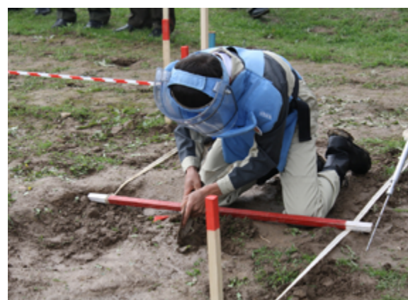
Mine clearance demonstration

Tajikistan became a State Party to the Mine Ban Treaty in 1999 and has since developed the Tajikistan Mine Action Center (TMAC). The government committed to remove all anti-personnel mines by 2010, but since then request an extension of ten more years to complete the removal of mined areas on the Tajik-Afghan border and the Central Region. Tajikistan is also party to the Convention on Conventional Weapons (CCW) but has not fulfilled the protocols demanded by the CCW. 54 Landmines,