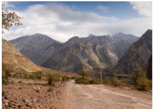
Rural Road

More than 90% of Tajikistan is mountainous, making its extensive network of roads too expensive for the cash-strapped nation. Roads are unevenly distributed throughout the country; they are concentrated in the western portion of the nation where mountains are lower and populations are more concentrated. 14 Moreover, extreme weather conditions bring torrential rains, freezing temperatures, and heavy snowfalls each year, which can lead to landslides that destroy the primitive roadways in the rural areas. Often it takes months for roadways to become passable after landslides. The civil war that took place in the 1990s severely damaged the rural transportation infrastructure. 15