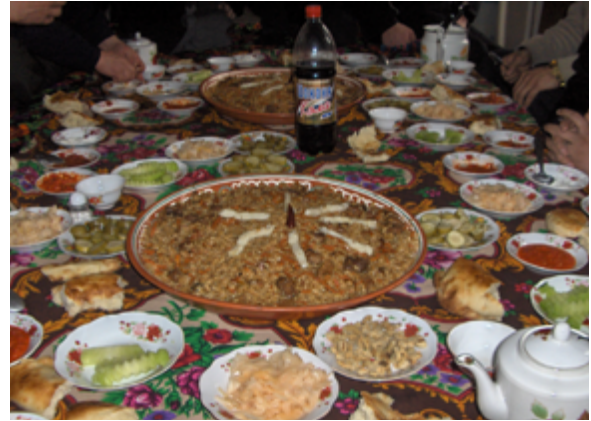
Tajik cuisine

Breakfast typically consists of tea and bread, but more prosperous families might add butter, jam and eggs or porridge to the meal. Soup made from a meat-based broth with vegetables, such as carrots, onions, and potatoes, is typically served for dinner. Rice dishes, such as osh made with carrots, onions, and meat, are served two or three times a week. Other typical dishes are pastries filled with meat and onion, pasta, and tomato and cucumber salad. 33 The Tajik national dish is kabuli pulao, a rice dish with shredded yellow turnip or carrot, meat, and olive oil. 34