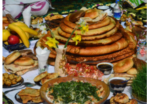
Table prepared for Navruz

during which men give flowers and gifts to women. Many Tajiks consider this new holiday a revival of an ancient Tajik spring celebration that was devoted to the veneration of women. 68, 69