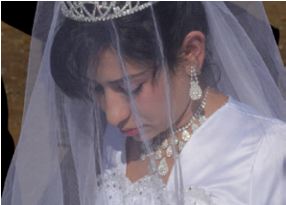
Tajik bride

Marriage between first cousins is common in all regions of the country. Young brides join their husband’s family, and their role and behavior are strictly regulated. They must prove themselves through silence, diligence, and hard work. They are referred to as kelin, which denotes their provisional status until they have proven themselves, usually by bearing sons. 31, 32