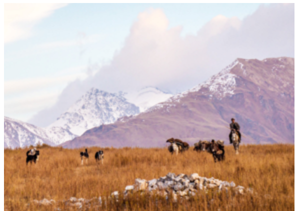
A Tajik shepherd

The government in Tajikistan is designed to allow varying levels of self-governance. The central government is meant to focus on national issues. Oblasts, the divisional regions of the country, deal with regional issues. Oblasts are divided into rayons and cities, each has its own executive body (khkukmat) and council (majlis). The lowest level of government is the jamoat. This tier is legally recognized in Tajikistan's constitution and functions as