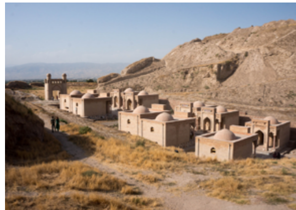
Dry climate in the summer, Hisor, Karategin

Tajikistan has a continental, subtropical and semi-arid climate, depending on elevation. Summers are hot and dry in the lowlands where temperatures range between 27°-30°C (80°-86°F). In the mountain ranges, summer temperatures range between 5°-10°C (41°-50°F). Winters in the lowlands are usually mild, ranging in temperature from -1°-3°C (30°-37°F). Extreme cold settles on the mountain ranges during winter. Normal temperature ranges are between -15°--20°C (5°--4°F), although temperatures as low as -45°C (-49°F) are common in some mountain areas. 7,