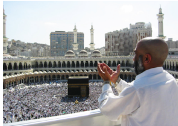
Pilgrim at Mecca in Saudi Arabia

The hajj—the holy pilgrimage to Mecca—is the fifth pillar of Islam and is required of all Muslims at least once in their lifetimes. Since Tajikistan is a majority Muslim country, the hajj is an important event. Regulated by the Committee on Religious Affairs (CRA), yearly pilgrimages to Saudi Arabia are arranged by the Tajik government. Bribery and corruption have been reported as a common practice in government management of hajj participants. 51