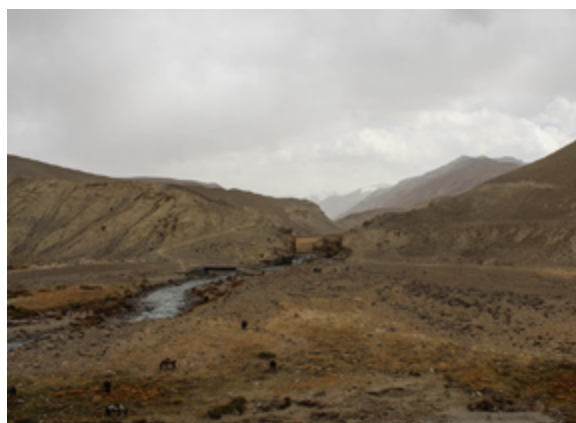
Tajik-Afghan border, Wakhan valley road, Gorno-Badakhshan

Border crossings along the Tajik-Afghan border are understandably sensitive. Because of the long-standing war in Afghanistan, greater controls have been placed on cross-border trade and relations. Smuggling and other criminal enterprises have sprung up in the region, and violence erupts regularly along the border. Westerners are strongly advised by their governments not to travel in this region. Most of the checkpoints between these two countries cross the Panj River, making crossings increasingly treacherous. 52, 53