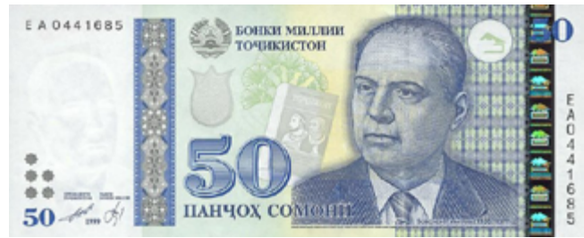
Tajikistan Somoni

The national currency of Tajikistan is the Somoni (TJS). There are 100 dirham in 1 Tajikistan Somoni (also pronounced as Somani). In January 2017, 1 USD was equal to about 7.8 TJS. 43, 44 Tajikistan has a cash only economy. Credit cards are rarely accepted (Visa and MasterCard), except at some high-end hotels and traveler’s checks cannot be cashed. 45 ATM machines are located in the Dushanbe Airport, in the main office of Agroinvestbank, in some large hotels, and department stores. 46 They are also available in some of the country’s larger cities such as Khujand, Istaravshan, Khorog, and Qurghon-Teppa, but not in Murghab, the capital of Murghob District. ATM machines do not always take the cards shown on the machine and some have very low withdrawal limits, so it is advisable to bring cash, especially US dollars, which are relatively easy to exchange. Bills should be minted after 1996 and display no tears, writing, or other marks. 47