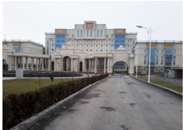
A hospital in Dushanbe

Although Tajikistan has achieved the status of polio free for 13 years, a serious outbreak occurred in 2010. In 2015, USAID donated oral polio vaccines to prevent another outbreak. 13 Medical care and supplies are far below Western standards and many hospitals and clinics reuse disposable medical supplies out of necessity. There is also a severe shortage of anesthetics, prescription drugs, and antibiotics. There have been outbreaks of hemorrhagic fever, hepatitis B & C (transmitted through medical or dental procedures), malaria, multidrug resistant tuberculosis (MDR-TB) and rabies. Typhoid was also reported in Dushanbe and the south. 14