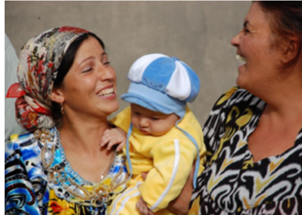
Mother and her baby

extravagant if the baby is a boy. A sheep will be slaughtered for the celebration if the baby is a boy. If the family is Russian, the family will generally have the baby baptized within the first few days after birth. 36