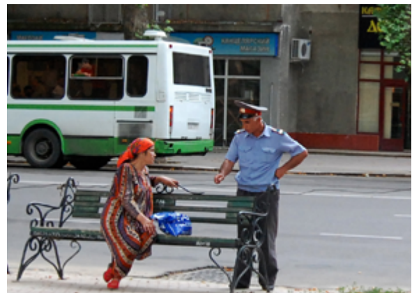
Conversation between a woman and a policeman

Urban areas are relatively stable and safe, but petty crime occurs on a regular basis. Muggers, pickpockets, and thieves have been known to target foreigners or those who appear affluent. Passports are attractive targets for thieves, who use them to commit more crimes. Women must exercise greater care than men, since some criminals have targeted women specifically. Threats to women range from verbal and physical harassment to rape, often involving “date rape” drugs. All visitors should exercise great caution while in Tajikistan. Avoid going out alone. Unless it is necessary, do not go out after dark, which is when criminal activity increases. Criminals often operate in groups and may be violent and undeterred by resistance. Tajik police are poorly funded and poorly trained. They often offer no assistance to victims. 53, 54, 55, 56