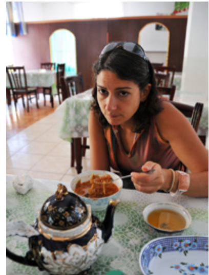
A local restaurant, Khorugh, Kuhistoni

Foreign guests should refrain from eating pork products or drinking alcohol. Although Tajikistan was greatly influenced by Soviet eating habits and alcohol consumption, it remains a Muslim country; eating pork and drinking alcohol may offend some people. Tea is very important to Tajiks. Guests should never refuse to drink tea that is offered to them. Eating with utensils is common in restaurants. When eating communally, diners should always use their right hand because the left hand is considered unclean. If utensils are provided, one should use them. 37, 38