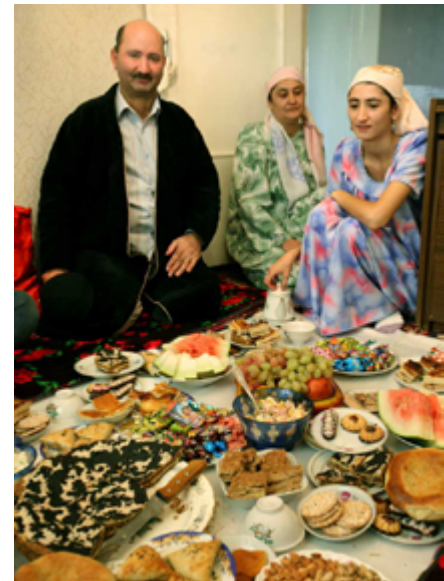
Celebrating Eid

Eid al-Fitr and Eid al-Adha are two important Islamic holidays, and the Tajik government recognizes them as national holidays. 52 Beginning the first day after the holy month of Ramadan, Eid al-Fitr is the “festival of fast breaking.” It celebrates the end of Ramadan and lasts for three days. During this time, ministries and other government offices shut down. People wear new clothes; engage in community prayers, and visit friends and relatives. Neighbors are invited for meals, and money and food are donated to local mosques as charity. Restaurants, cafes, and bakeries experience an upsurge in business as people flock to them for celebratory meals and dishes. 53, 54, 55