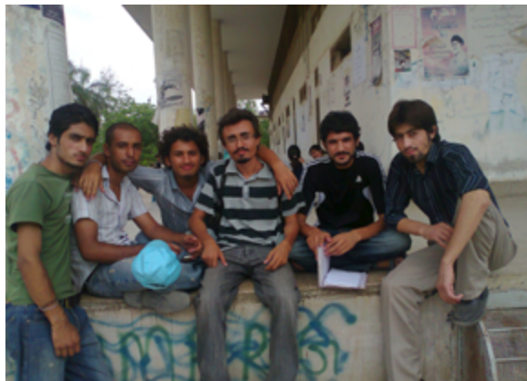
A group of university students

Adolescents play a strong role in the Tajik family. Although many teens attend school, a large number have left school and entered the workforce. Because of extreme poverty across the country, teenage boys often have no choice but to leave home to find work. For some teenage girls, life can become very difficult. Some girls are married off to older men. Still others find themselves lured by false promises of lucrative employment abroad, only to be sold into sexual slavery in places like Russia or the United Arab Emirates. Some teens try to keep up with Western trends. Many wear Western clothes, listen to Western music, and enjoy spending time with friends. 21, 22, 23