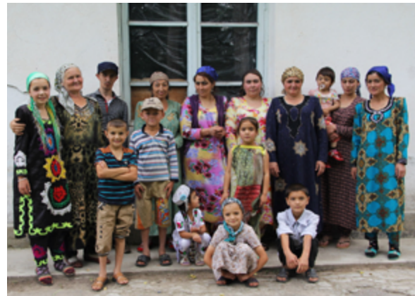
Tajiks wearing traditional dresses

Tajik men and young people working in the public and non-profit sectors typically wear Western-style clothing. 44, 45 Tajik women, however, commonly wear traditional curta (dresses) made of cotton or silk with aezor, or jomas (baggy, wide colorful pants) underneath. The traditional outfit is complete with a head covering that varies, depending on marital status, region, tribal affiliation, and time of year. Girls and young unmarried women might wear intricately detailed and brightly colored skull caps. 46, 47