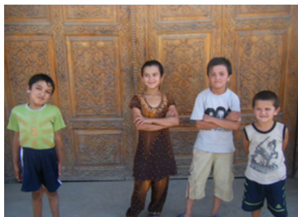
Tajik children

Children are expected to care for and be obedient to their parents. Young people are told that it is “their parent’s duty to marry them off, while their duty is to bury their parent.” 24 Tajik children are respected and loved, but poverty has created hardships for them. Their access to quality healthcare, nutrition, and education is limited. Often they are kept out of school to work, especially in rural areas closely tied to the cotton industry. 25, 26, 27, 28