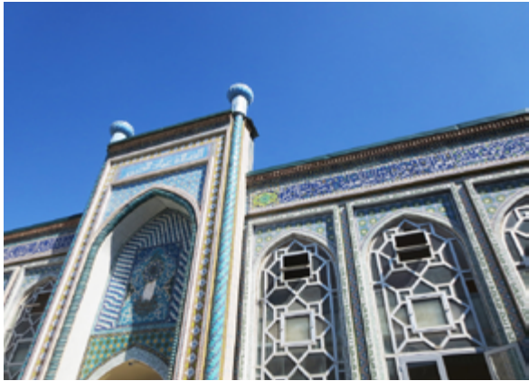
Central Mosque, Dushanbe

The small Jewish population in Tajikistan formerly had one synagogue, which was demolished in 2008 to make room for a planned presidential palace. In 2009, a building was donated to the Jewish community of Dushanbe to use as a synagogue. 57 Christian groups face difficulties in maintaining their buildings of worship. Only officially registered Christian groups are allowed to operate churches. Churches that operate without official status are closed down. Dushanbe’s