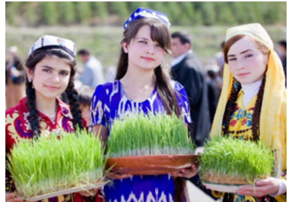
Tajik girls during Navruz

The three major languages spoken in Tajikistan are Tajik, Uzbek and Russian. Of the four major ethnic groups in Tajikistan, Tajiks make up approximately 80% of the population. Descendants of ethnic Iranians, Tajiks are distributed throughout the country. 89, 90, 91,92 Uzbeks are the second-largest ethnic group in the country and are descendants of Turks who migrated to Central Asia. They live primarily along Tajikistan's western border and make up approximately 15% of the population. Underrepresented in parliament, Uzbeks have faced significant government oppression. Relations between Uzbeks and Tajiks are tense. 93,94