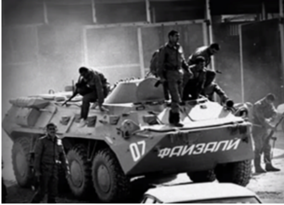
Spetsnaz troopers during civil war

In 1992, regional forces vying for control of the new country erupted into civil war. The war waged until 1997 when the government brokered a peace agreement between the warring factions. After five years of fighting, more than 50,000 people were left dead and more than one tenth of the population became refugees. War related economic damage is still felt throughout the country, which has caused an increase in religious radicalization. Nevertheless, Russia has continued to