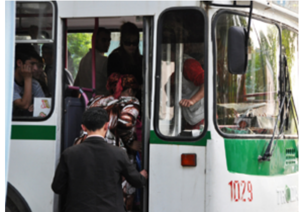
Public bus, Dushanbe

people around within and between cities. Armed police and military personnel at checkpoints frequently stop drivers to check documentation. They are notorious for exacting bribes. Drivers in vehicles with government-issued license plates often speed, ignore traffic lights, and refuse to stop at checkpoints. Public transportation is generally unreliable, unsafe, and overcrowded. Travel should be done during daylight and on routes that are known to the travelers or their escorts. Accidents are common and traffic police pay little attention to safety issues. 50, 51, 52