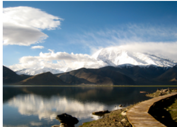
Karakul Lake

Lakes are another important part of Tajikistan's hydrologic system. Karakul Lake, located in the Pamir Mountains of northeastern Tajikistan, sits at approximately 3,900 m (12,795 ft) above sea level. Fed by three small rivers and numerous streams, the lake has no real drainage, and consequently, the water is too salty for drinking or irrigation. It averages 8 km (5 mi) in length and 4 km (2.5 mi) in width. Its eastern portion averages 22 m (72 ft) in depth; its deepest point is 236 m (774 ft) in the western portion. 38, 39