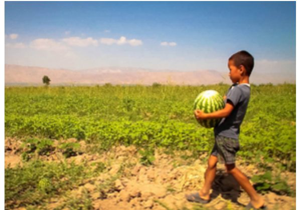
Child working in watermelon field

The pervasive poverty in Tajikistan makes it difficult for families to educate their children. Parents are often too poor to cover expenses related to education, such as buying shoes, clothing, books, and school supplies. Furthermore, in recent years, economic hardship has forced many rural men to migrate abroad to find work so the labor of children is required to help feed families. This situation creates a gender gap in the schools. When forced to choose, parents prefer to educate their boys rather than their girls. 25, 26, 27, 28, 29, 30