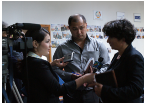
Press interview in Khovar

Television is the most popular form of media in Tajikistan. Numerous private stations exist, as well as Russian and government-run channels. More than 200 newspapers are registered in the nation, although there are no daily papers. Government and political newspapers have a larger readership than private papers. Freedom of the press is limited, even though it is a constitutional right. Journalists are routinely harassed and intimidated. There are nearly 1.5 million internet users in the country. The government routinely blocks access to independent websites, including social media and news websites. 78, 79, 80, 81