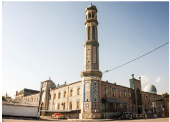
Dushanbe Mosque

Islam is a monotheistic religion and its followers believe in a single deity. The Muslim community, or umma , calls this deity Allah. The Arabic term islam means “to submit” or “to surrender.” So a Muslim is one who submits to the will of Allah. 9 Muslims believe that Allah revealed his message to the Prophet Muhammad, a merchant who lived in Arabia from 570 to 632 C.E. Allah's message, as relayed by Muhammad, is delivered in the Quran, the sacred text of Islam. Additional doctrinal guides include the Hadith, a collection of the sayings of Muhammad, and the Sunna , which describes the practices of Islam by way of Muhammad's example. 10 Most Tajik Muslims follow the Hanafi School of Islamic Jurisprudence, the most widespread school of Islamic law. The Hanafi School is considered relatively liberal regarding women and marriage contracts. 11, 12