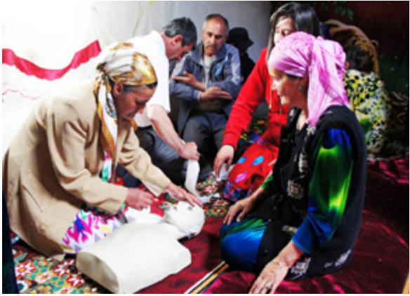
Training the local Emergency Response Team

Like many other services in Tajikistan, rural healthcare services fall below Western standards and, consequently, the majority of rural Tajiks lack access to basic healthcare. Economic devastation resulting from the civil war had severe effect on rural healthcare. Many rural areas lacked healthcare professionals, and people were required to travel to urban areas to seek medical care. The problem persists today, despite programs aimed at improving rural residents’ access to healthcare professionals and services. The World Bank has funded the Basic Health Project since 2006 in an effort to provide quality family care to rural Tajik communities. 18, 19