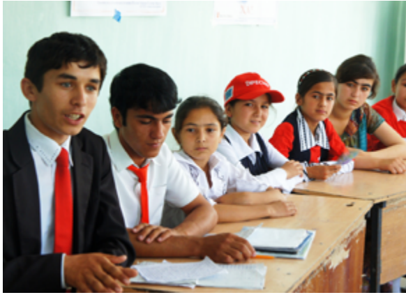
Children in school

general secondary education, students can choose an academic track (grades 10-11) or vocational training. 25 The Tajikistan Ministry of Education is planning to change to 12 years of compulsory education by adding one year of primary school in 2020. 26 In 2013, there were approximately 30 institutions of higher education in Tajikistan, but they are not free and government funding of this sector is only about 212 USD per student per year. 27 One of the country’s largest and oldest university, Khujand State University, was founded in 1932. 28