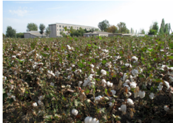
Cotton fields

Agriculture is the primary source of income in rural Tajikistan, employing more than half of the nation's labor force. 8, 9 Private plots, small farms, and small herds of animals provide a subsistence existence for many rural Tajiks. But few people have the resources to save or produce a surplus of food or goods. As a result, they are often forced to sell portions of their limited resources. 10 By necessity, many rural Tajiks cultivate cotton, Tajikistan's main agricultural export crop. Government regulations and subsidies provide the resources necessary to employ large numbers of people. In reality, government corruption permeates the industry. Many farmers have been forced to plant cotton to the exclusion of other crops, leaving people without sufficient food supplies. The resulting poverty has forced families to resort to child labor; children earn money by picking cotton to help their families survive the long winters. The country also exports limited quantities of fruit, vegetables, and silk products. 11, 12, 13