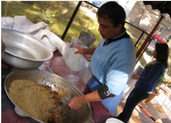
Plov for lunch

Tajikistan is the poorest of the 15 former Soviet Republics, where the average annual income is $2,780. About 21% of Tajikistan's urban residents are severely food insecure. These families consume poor diets of limited nutritional value, resulting in child malnutrition and poor general health. 4 More than 90% of urban Tajiks have access to clean drinking water and hygiene, but in recent years droughts have negatively impacted water supplies, and some hospitals have suffered from a lack of clean water. 5, 6