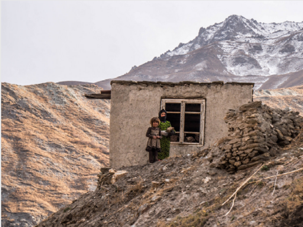
Inhabitants of the isolated mountain village of Pastigov, Leninobod