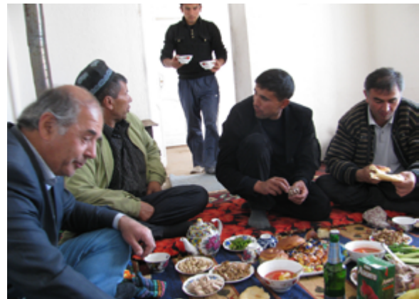
A Tajik man having a meal with his guests

Socializing is an important aspect of Tajik society, and meals served on special occasions can last for hours, and be followed by dancing. A traditional Tajik home includes a special room for entertainment, which is used for male socializing and on special occasions when men and women socialize together. 27