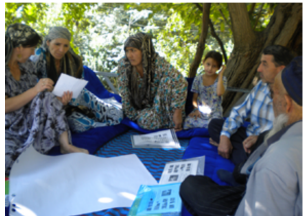
Tajik men and women in conversations

Gender roles differ greatly between rural and urban areas. Religiously observant Muslims in all areas of Tajikistan will avoid contact with the opposite sex in their homes, as well as in public. 23 Progressive urbanites usually follow Soviet-style gender equality norms, whereby males and females have at least the outward appearance of equality. In rural areas, people follow highly formalized traditional gender roles. For example, some women may refuse to answer questions posed to them by an unknown man. Gender division of labor is strict, and men exert a high degree of control over all aspects of family and community life. 24