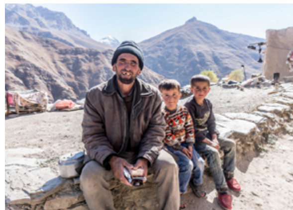
Yaghnobi man and his sons in the mountain village of Kirionte, Northern Tajikistan

Russians have occupied portions of Tajikistan since the mid-nineteenth century, however, after Tajikistan gained independence from the Soviet Union in 1991, many Russians left. After the fall of the Soviet Union in December 1991, most of the former Russian population emigrated out of Tajikistan. The Russians who remained, however, continue to live in small urban pockets in the western part of the country, and generally, do not have the financial means to leave the country. Russians in Tajikistan are highly valued for their technical skills and education. 95,96