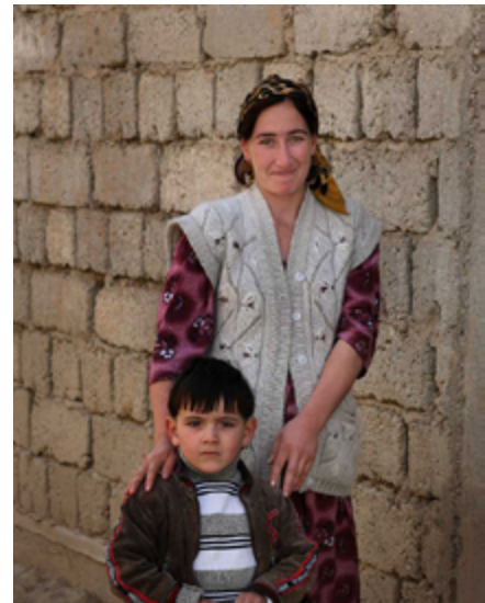
Mother and her son

Families in Tajikistan tend to be large, although family size has begun to decline in recent years. The nuclear family is the basic family unit. When families have more than one son, the youngest son remains at home with his parents after he marries. In this family structure, the father rules the family, and the daughter-in-law falls under the authority of the mother. 10, 11, 12, 13