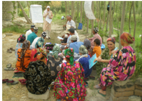
Field schools for women farmers

Tajikistan's constitution guarantees religious freedom, yet the government regulates religious worship, dress, and education. 46, 47 In recent years, however, the country has witnessed a rise in conservative Islamic values, resulting in a revival of patriarchal clan structures and traditional gender divisions of labor. In response, the government has strictly regulated the naming of children, as well as women wearing headscarves in schools, and men wearing beards in public buildings. 48, 49 In 2004, the Tajikistan Ulema Council issued a fatwa (legal ruling by recognized religious authority) prohibiting women from praying in mosques. As of 2016, this fatwa remained in force. 50