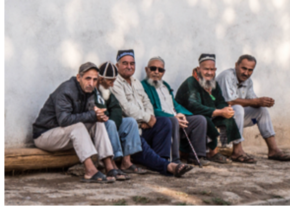
Tajik men wearing tupi

(skullcaps) are also worn. The most popular toki kallapush is the black and white chusti, which is embroidered. Some men also wear a solid colored curta that is similar to, but shorter than, the woman's curta. 52, 53