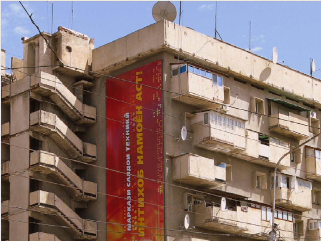
Urban apartments