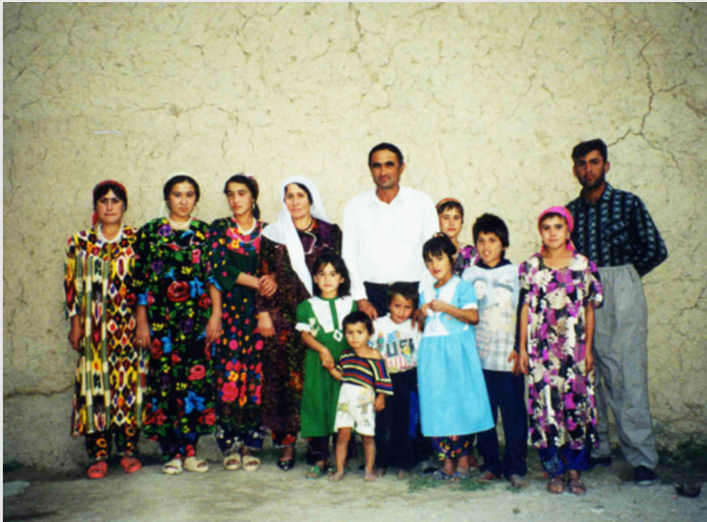
Tajik family