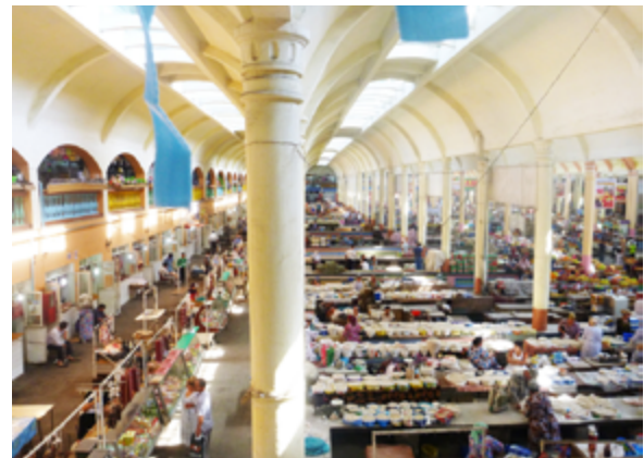
Marketplace, Khujand

In urban Tajikistan, much of people’s daily shopping is conducted at their neighborhood, in the local bazaar or the street market. 39 Numerous bazaars exist in each Tajik urban area, and they provide locals with a variety of items, such as food, clothing, personal hygiene products, religious gear, and automotive parts. Bargaining with a merchant at a bazaar is acceptable. 40