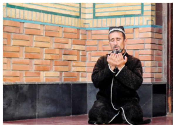
Praying at the mausoleum

All Muslims regard the Quran as sacred. It is thus important to treat Islam's holy book with respect. Do not touch the Quran with dirty hands and keep it off the floor—if you are sitting on the floor, hold the Quran above your lap or waist. When not in use, protect the Quran with a dustcover and do