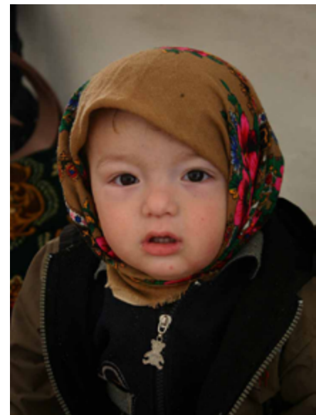
Tajik toddler

Traditionally, because of their Zoroastrian and Iranian roots, Tajik names took on Persian forms. During the Soviet era, Slavic endings became common, and people added them to their names. The current president of Tajikistan, formerly known as Emomali Rahmonov, removed the Slavic ending of his name and now formally uses Rahmon. The president decreed in 2007 that all Tajiks should follow suit to reflect the ties to the Persian culture. He has also strongly encouraged people to avoid names that relate to war, insisting instead that people choose names for their children from the Persian epic poem Shahnameh (Book of Kings). But Islamic names have become fashionable in the country. Some young people are changing their Persian and Tajik names to Islamic names, and many new parents are giving Islamic names to their newborns. 45, 46, 47, 48, 49, 50