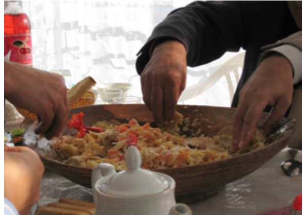
Kurutob eating with right hands

Pointing the bottoms of one's feet to others when sitting down is offensive, as is blowing one's nose in public. Also, never step over a person's legs or step in front of others who are sitting. If you step on someone else's foot, an apology is required. Never use your left hand during interactions and exchanges. The left hand is considered "unclean" since it is used for personal hygiene after using the latrine. Only use your right hand to exchange money or gifts, or when shaking hands or passing food. Placing a thumb through a middle and index finger is considered obscene. 85, 86