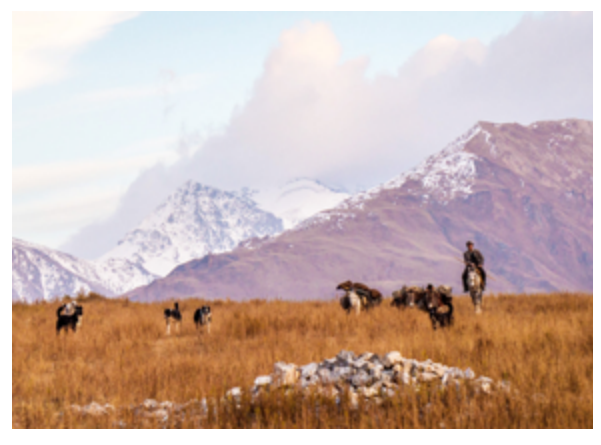
A Tajik shepherd

The government in Tajikistan is designed to allow varying levels of self-governance. The central government is meant to focus on national issues. Oblasts, the divisional regions of the country, deal with regional issues. Oblasts are divided into rayons and cities, each has its own executive body (khkukmat) and council (majlis). The lowest level of government is the jamoat. This tier is legally recognized in Tajikistan's constitution and functions as