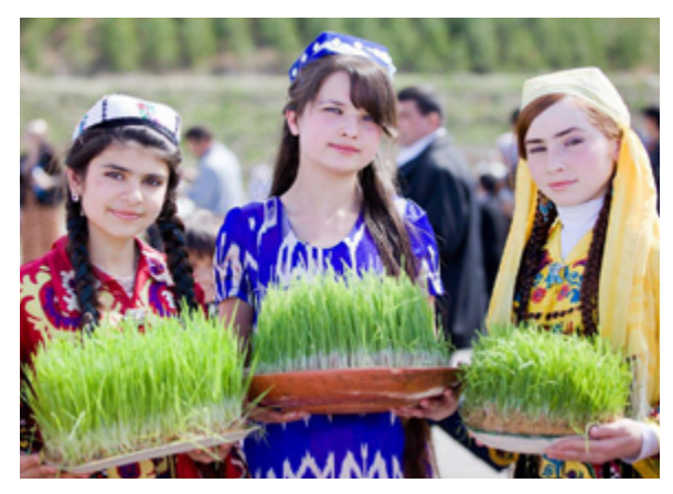
Tajik girls during Navrūz

The three major languages spoken in Tajikistan are Tajik, Uzbek and Russian. Of the four major ethnic groups in Tajikistan, Tajiks make up approximately 80% of the population. Descendants of ethnic Iranians, Tajiks are distributed throughout the country.<sup>89, 90, 91,92</sup> Uzbeks are the second-largest ethnic group in the country and are descendants of Turks who migrated to Central Asia. They live primarily along Tajikistan's western border and make up approximately 15%