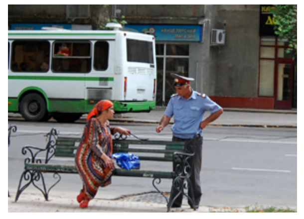
Conversation between a woman and a policeman

Urban areas are relatively stable and safe, but petty crime occurs on a regular basis. Muggers, pickpockets, and thieves have been known to target foreigners or those who appear affluent. Passports are attractive targets for thieves, who use them to commit more crimes. Women must exercise greater care than men, since some criminals have targeted women specifically. Threats to women range from verbal and physical harassment to rape, often involving "date rape" drugs. All