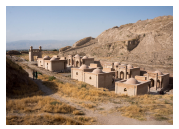
Dry climate in the summer, Hisor, Karategin

Tajikistan has a continental, subtropical and semi-arid climate, depending on elevation. Summers are hot and dry in the lowlands where temperatures range between 27^{\circ}-30^{\circ} C ( 80^{\circ}-86^{\circ} F). In the mountain ranges, summer temperatures range between 5^{\circ}-10^{\circ} C ( 41^{\circ}-50^{\circ} F). Winters in the lowlands are usually mild, ranging in temperature from -1^{\circ}-3^{\circ} C ( 30^{\circ}-37^{\circ} F). Extreme cold settles on the mountain ranges during winter. Normal temperature ranges are between -15^{\circ}--20^{\circ} C ( 5^{\circ}--4^{\circ} F),