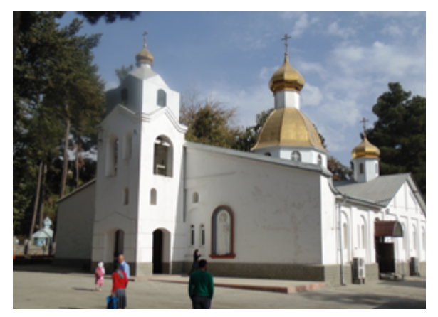
Russian Orthodox St. Nicholas Church, Dushanbe

in the remote mountainous terrain of the Gorno-Badakhshan Autonomous Region in eastern Tajikistan.<sup>1, 2</sup> The remaining 10% of the population are Christians, Baha'is, Jehovah Witnesses, and Jews. Christians make up the largest non-Muslim groups.<sup>3, 4, 5</sup> Of the approximately 150,000 Christians, Russian Orthodox constitute the largest group.<sup>6</sup> Baha'is have been in Tajikistan since the early 20th century, but face government opposition.<sup>7</sup> Most of Tajikistan's Jewish population, divided