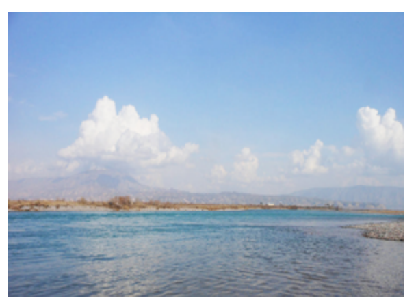
Vakhsh River

The Amu Darya, located in southwestern Tajikistan, is also very important to the nation's survival.<sup>25</sup> Formed by the confluence of the Panj and Vakhsh rivers, the Amu Darya drains an enormous amount of water on its way to the Aral Sea, creating irrigation for agriculture and hydroelectricity.<sup>26</sup> The Amu Darya, the longest river in Central Asia, reacts delicately to changes in precipitation and glacier ice melt.<sup>27, 28</sup>