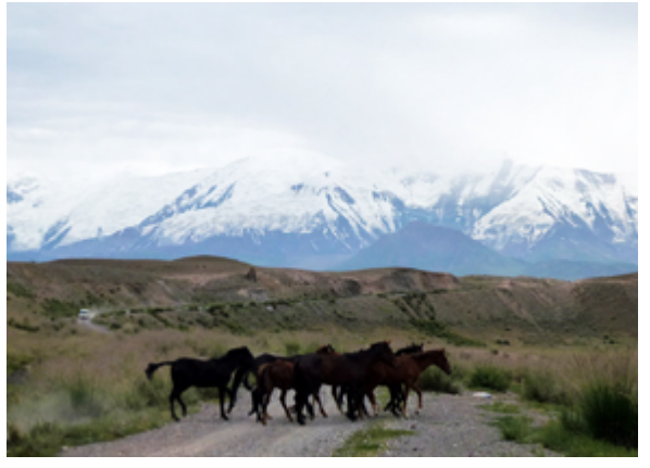
Pamir Mountains Flickr / twiga269 FEMEN #JeSuisCharlie

World," the Pamir Mountains occupy the entire eastern portion of the country.<sup>9</sup> The elevation is partially responsible for the dryness of the region; much of the area is a high desert and humidity can measures below 10%. Numerous peaks in the Pamir Mountains rise above the 7,000 m (22,966 ft) mark.<sup>10</sup> Despite the high elevation and extreme temperatures, the Pamirs are home to many animals, such as marmot, ibex, snow leopard, hare, Marco Polo sheep, brown bears, and wolves. Seismic