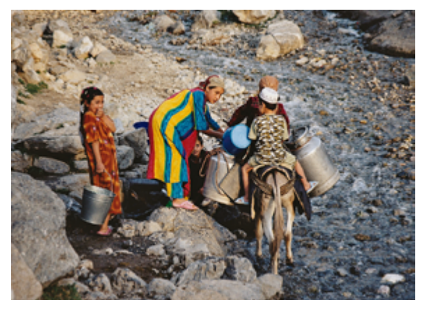
Rural village life

Mahallas make decisions concerning the resolution of disputes among family members and neighbors; they decide on marriages, divorces, and other family issues. They also organize public works and services, such as the building and repair of irrigation systems, the building of schools and other public and religious structures, and the care of widows and the elderly. Issues involving agriculture, herding, grazing, and water access are all