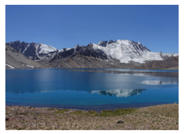
Landscape of Tajikistan

Tajikistan is a small, landlocked, mountainous country located in Central Asia. Its total land area equals 144,100 sq km (55,251 sq mi), making it slightly smaller than Wisconsin. Approximately 2,590 sq km (1,000 sq mi) is water. Tajikistan shares borders with China to the east (414 km/257 mi), Kyrgyzstan to the north (870 km/541 mi), Afghanistan to the south (1,206 km/749 mi), and Uzbekistan to the west (1,161 km/721 mi).<sup>5, 6</sup>