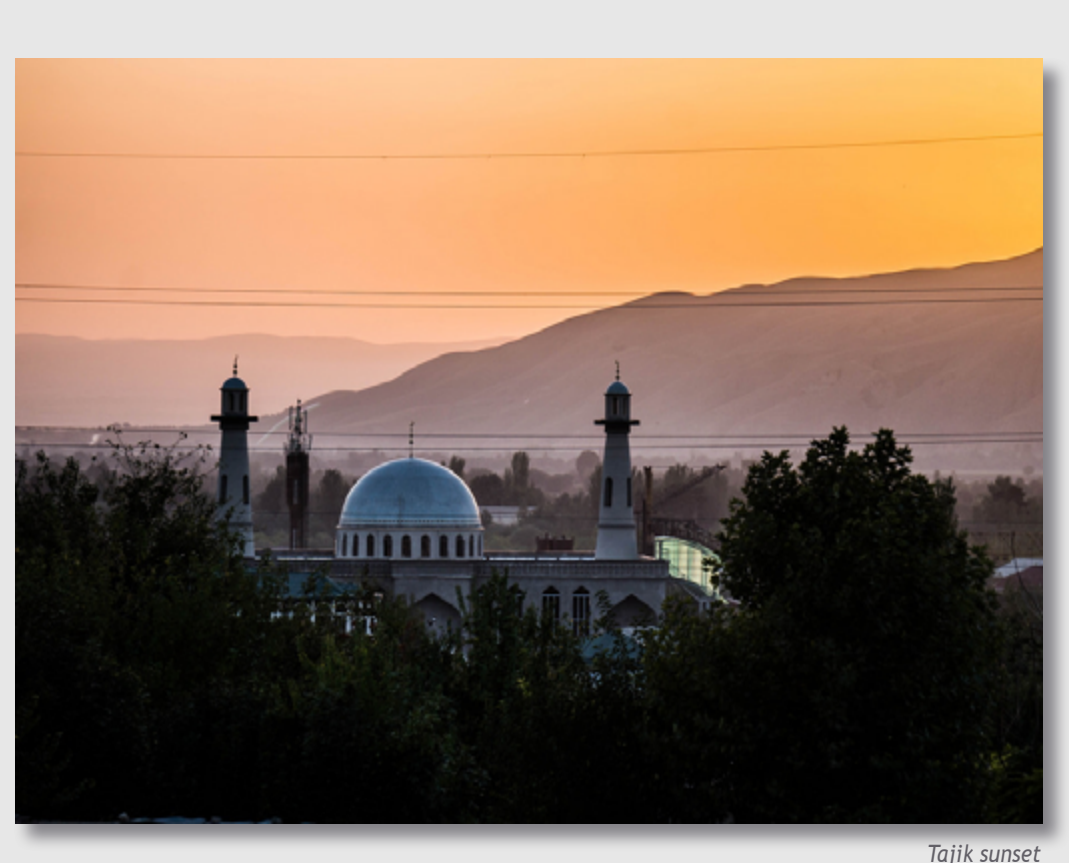
Tajik sunset