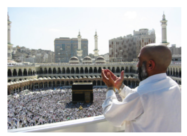
Pilgrim at Mecca in Saudi Arabia

The hajj—the holy pilgrimage to Mecca—is the fifth pillar of Islam and is required of all Muslims at least once in their lifetimes. Since Tajikistan is a majority Muslim country, the hajj is an important event. Regulated by the Committee on Religious Affairs (CRA), yearly pilgrimages to Saudi Arabia are arranged by the Tajik government. Bribery and corruption have been reported as a common practice in government management of hajj participants.<sup>51</sup>