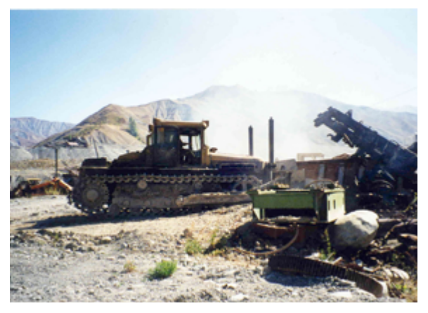
Privatization of business has been on the rise since the end of the civil war. Numerous businesses have opened, and employment in the private sector has continued to grow. But only around 70% of private businesses in Tajikistan function properly.<sup>12</sup>

Since the end of the civil war in 1997, Tajikistan's economy has experienced sustained and consistent growth. Yet, the nation continues to suffer from high unemployment rates and poverty. As recorded with the Tajikistan Agency on Employment and Social Protection of Population in 2014, the official unemployment rate was 10.9%.<sup>7</sup> Unofficial unemployment data, however, suggest that unemployment varies from 30-45% due to a shortage of skilled labor.<sup>8, 9, 10, 11</sup>