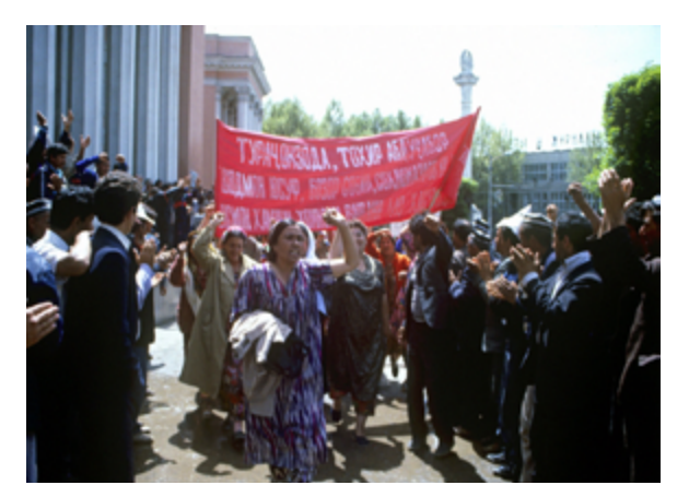
Tajiks rallying shortly after independence, 1992

Today's Tajiks are descended from the diverse groups of Iranians who lived in the Central Asian Tajikistan region for more than 2500 years. The area was conquered by Alexander the Great during the fourth century B.C.E.<sup>56</sup> By the third century, Zoroastrianism became the dominant religion and the Persian language and culture spread even further across the region. Islam arrived in the eight century with the conquering Arabs and 100 years later became the dominant religion.<sup>57</sup> A number of successive invasions led by the Turks, Mongols, and Uzbeks between the 11th and 16th centuries resulted in the Uzbeks dividing the area of modern-day Tajikistan into a series of khanates. The Uzbeks continued to rule this area until the mid-19th century, when the Russians instituted cotton cultivation and began taking control of the region's economy.<sup>58, 59, 60</sup>