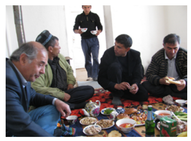
A Tajik man having a meal with his guests

Hospitality and generosity are important values in Tajik culture. Gift-giving is common in Tajikistan. When Tajiks present