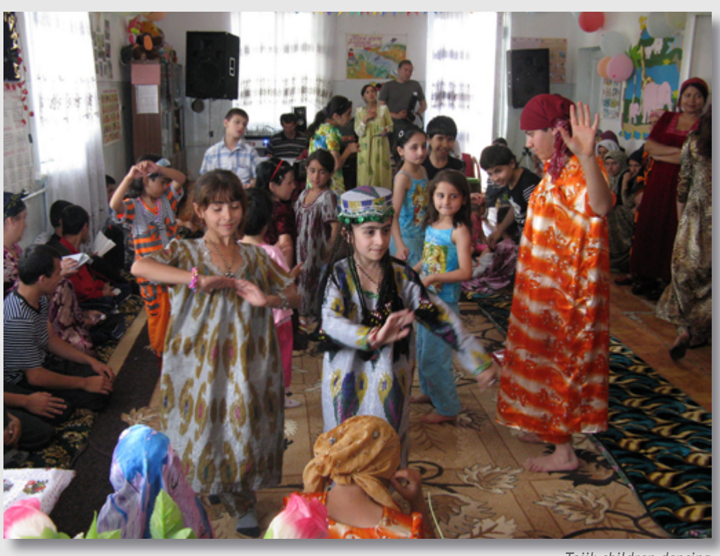
Tajik children dancing