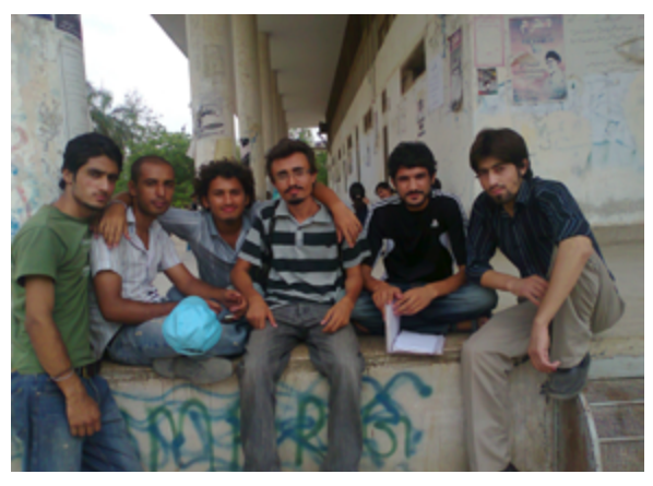
A group of university students

Adolescents play a strong role in the Tajik family. Although many teens attend school, a large number have left school and entered the workforce. Because of extreme poverty across the country, teenage boys often have no choice but to leave home to find work. For some teenage girls, life can become very difficult. Some girls are married off to older men. Still others find themselves lured by false promises of lucrative employment abroad, only to be sold into sexual slavery in places like