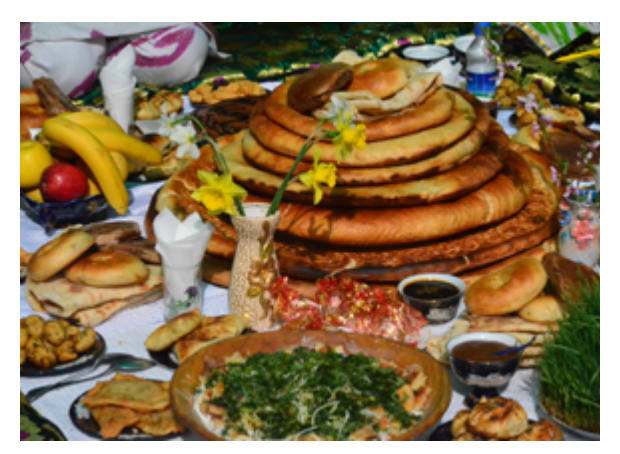
Table prepared for Navruz

One of Tajikistan's most cherished holidays, Id-i-Navruz (also called Nowruz), is celebrated on 21 March. Although occurring on the spring equinox and rooted in an ancient Zoroastrian agricultural festival, most Tajiks associate this holiday with the Islamic New Year.<sup>70</sup> The festival honors new life and rebirth, friendship and renewal.<sup>71</sup>