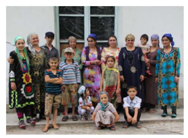
Tajiks wearing traditional dresses

Tajik men and young people working in the public and non-profit sectors typically wear Western-style clothing.<sup>44,</sup> <sup>45</sup> Tajik women, however, commonly wear traditional curta (dresses) made of cotton or silk with aezor, or jomas (baggy, wide colorful pants) underneath. The traditional outfit is complete with a head covering that varies, depending on marital status, region, tribal affiliation, and time of year. Girls and young unmarried women might wear intricately detailed and brightly colored skull caps.<sup>46, 47</sup>