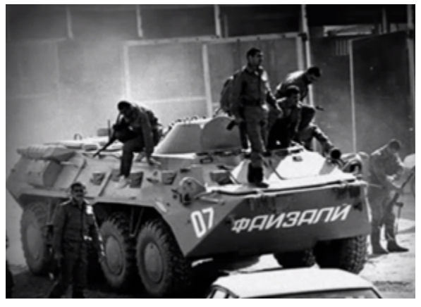
Spetsnaz troopers during civil war

In 1992, regional forces vying for control of the new country erupted into civil war. The war waged until 1997 when the government brokered a peace agreement between the warring factions. After five years of fighting, more than 50,000 people were left dead and more than one tenth of the population became refugees. War related economic damage is still felt throughout the country, which has caused an increase in religious radicalization. Nevertheless, Russia has continued to