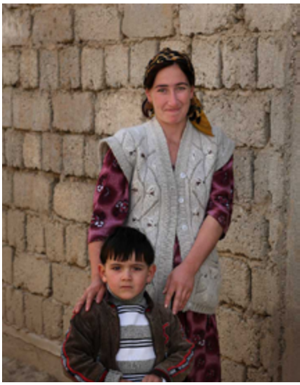
Mother and her son