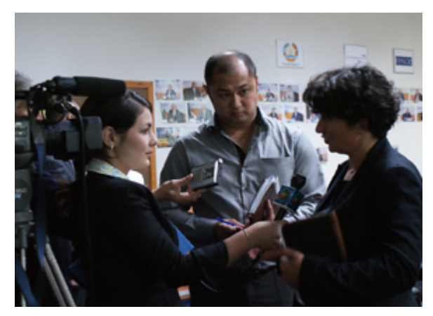
Press interview in Khovar

Television is the most popular form of media in Tajikistan. Numerous private stations exist, as well as Russian and government-run channels. More than 200 newspapers are registered in the nation, although there are no daily papers. Government and political newspapers have a larger readership than private papers. Freedom of the press is limited, even though it is a constitutional right. Journalists are routinely harassed and intimidated. There are nearly 1.5 million internet users in the country. The