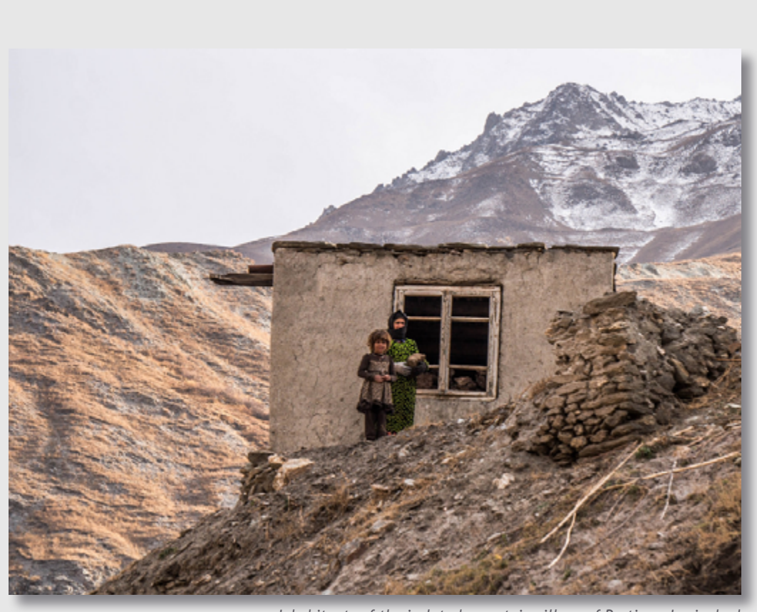
Inhabitants of the isolated mountain village of Pastigov, Leninobod