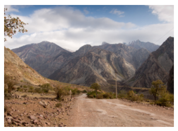
Rural Road

More than 90% of Tajikistan is mountainous, making its extensive network of roads too expensive for the cash-strapped nation. Roads are unevenly distributed throughout the country; they are concentrated in the western portion of the nation where mountains are lower and populations are more concentrated.<sup>14</sup> Moreover, extreme weather conditions bring torrential rains, freezing temperatures, and heavy snowfalls each year, which can lead to landslides that destroy the primitive roadways in the