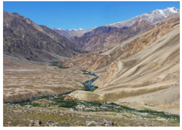
Gunt valley between Bachor & Yashilkul

Only 7% of Tajikistan's land area are designated as valley zones. There are two valley zones: The Fergana Valley of the northwest and the river valleys of the southwest. The valleys are important for water distribution, agriculture, and hydroelectric power production. The valleys are the most densely populated areas of the country.<sup>14</sup> Cotton, fruit, and raw silk production are crucial to the economic security of the region. The Syr Darya River and Kairakum Reservoir are