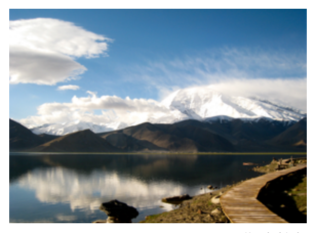
Karakul Lake

Lakes are another important part of Tajikistan's hydrologic system. Karakul Lake, located in the Pamir Mountains northeastern of Tajikistan, sits at approximately 3,900 m (12,795 ft) above sea level. Fed by three small rivers and numerous streams, the lake has no real drainage, and consequently, the water is too salty for drinking or irrigation. It averages 8 km (5 mi) in length and 4 km (2.5 mi) in width. Its eastern portion averages 22 m (72 ft) in depth; its deepest