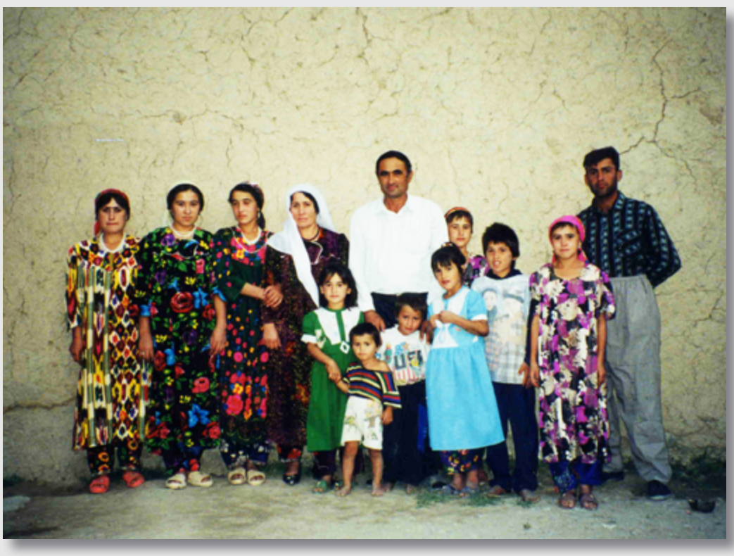
Tajik family