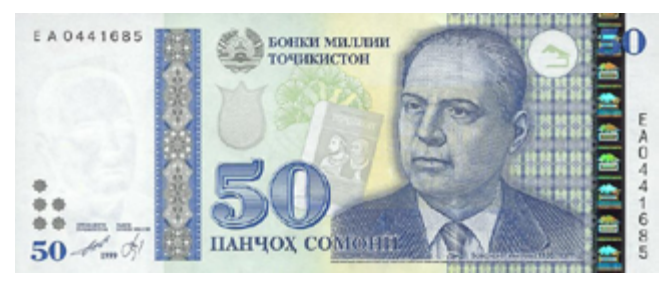
Tajikistan Somoni

The national currency of Tajikistan is the Somoni (TJS). There are 100 dirham in 1 Tajikistan Somoni (also pronounced as Somani). In January 2017, 1 USD was equal to about 7.8 TJS.<sup>43, 44</sup> Tajikistan has a cash only economy. Credit cards are rarely accepted (Visa and MasterCard), except at some high-end hotels and