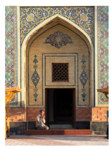
Morning prayer at the mosque

Once inside the mosque, there are certain things that non-Muslims should not touch, including books or walls (especially the western corner where people direct their prayers). Some mosques also have a shrine that should not be touched. Visitors should remain silent while prayers are in progress, and all electronic devices must be shut off or silenced. Food and drink are prohibited in mosques. Do not interrupt or walk in front of anyone who is praying. This invalidates their prayer and it will upset the worshippers. These rules apply in all situations where someone is praying, whether inside or outside the mosque.<sup>67, 68, 69</sup>