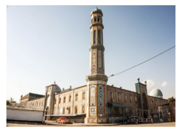
Dushanbe Mosque

Islam is a monotheistic religion and its followers believe in a single deity. The Muslim community, or umma , calls this deity Allah. The Arabic term islam means "to submit" or "to surrender." So a Muslim is one who submits to the will of Allah.<sup>9</sup> Muslims believe that Allah revealed his message to the Prophet Muhammad, a merchant who lived in Arabia from 570 to 632 C.E. Allah's message, as relayed by Muhammad, is delivered in the Quran, the sacred text of Islam. Additional doctrinal