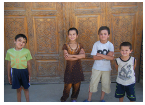
Tajik children

Children are expected to care for and be obedient to their parents. Young people are told that it is "their parent's duty to marry them off, while their duty is to bury their parent."<sup>24</sup> Tajik children are respected and loved, but poverty has created hardships for them. Their access to quality healthcare, nutrition, and education is limited. Often they are kept out of school to work, especially in rural areas closely tied to the cotton industry.<sup>25, 26, 27, 28</sup>