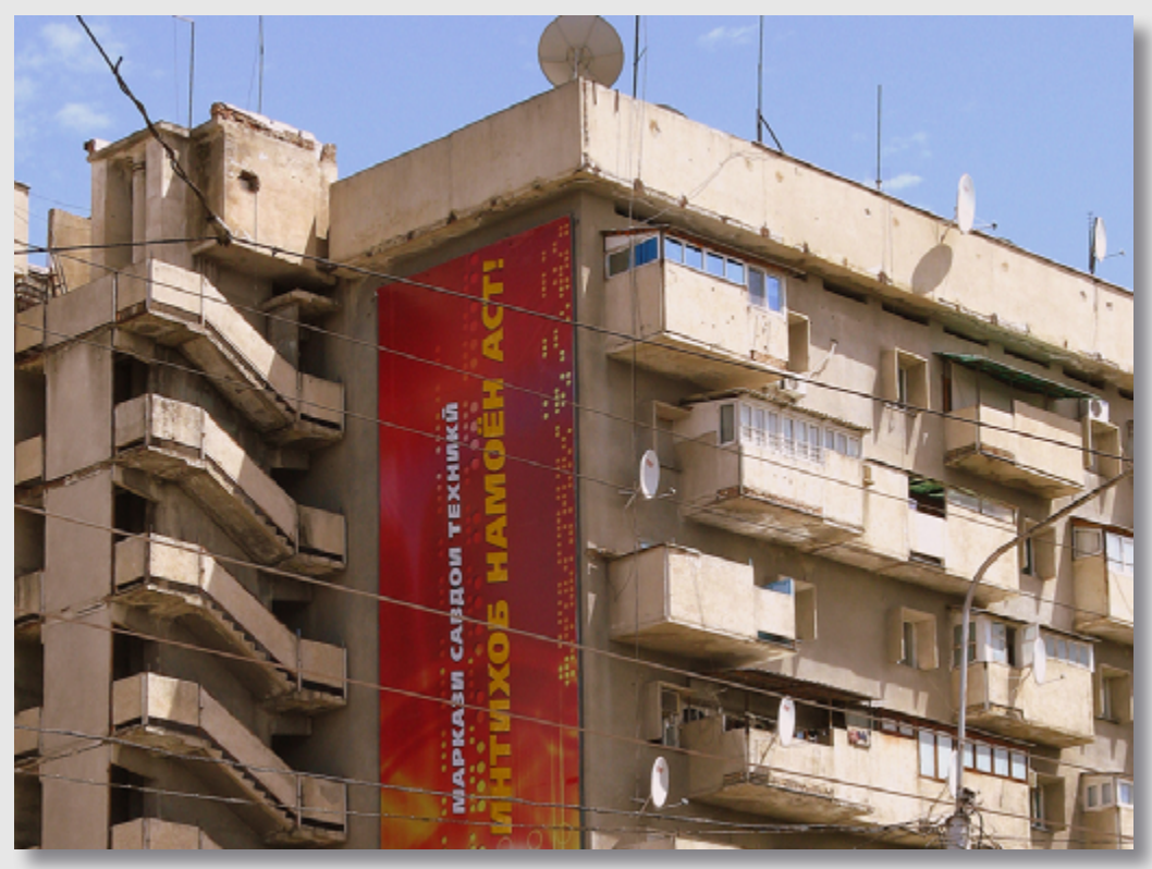
Urban apartments