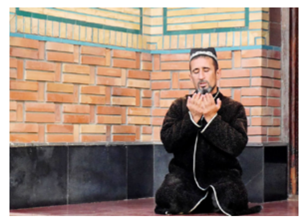
Praying at the mausoleum

All Muslims regard the Quran as sacred. It is thus important to treat Islam's holy book with respect. Do not touch the Quran with dirty hands and keep it off the floor—if you are sitting on the floor, hold the Quran above your lap or waist. When not in use, protect the Quran with a dustcover and do