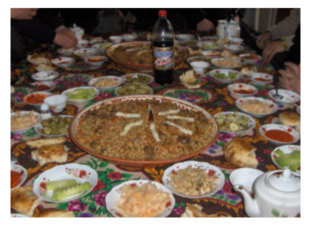
Tajik cusine

Breakfast typically consists of tea and bread, but more prosperous families might add butter, jam and eggs or porridge to the meal. Soup made from a meat-based broth with vegetables, such as carrots, onions, and potatoes, is typically served for dinner. Rice dishes, such as osh made with carrots, onions, and meat, are served two or three times a week. Other typical dishes are pastries filled with meat and onion, pasta, and tomato and cucumber salad.<sup>33</sup> The Tajik national dish is kabuli