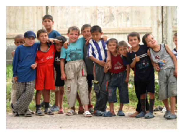
Young Tajik boys

Circumcision is a rite of passage for Tajik boys. At the age of five, an elaborate ceremony is conducted at which a local religious leader performs the circumcision. However, some parents wait until their son is around the age of 14 so they have enough time to save money for the celebration. Tajik females are considered adults once they start menstruating, while sexual maturity defines adulthood for males. Eighteen is the legal age of adulthood in Tajikistan. Ayoung female is not considered