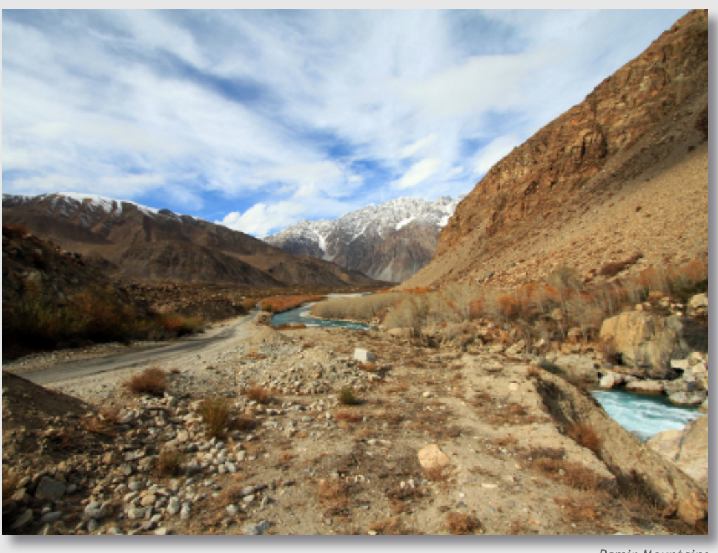
Pamir Mountains