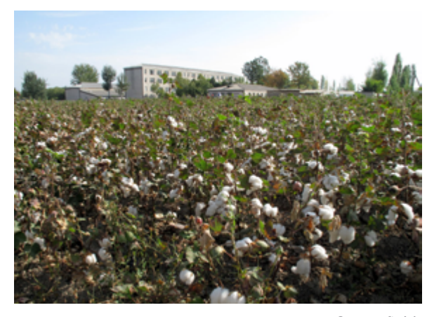
Cotton fields

Agriculture is the primary source of income in rural Tajikistan, employing more than half of the nation's labor force.<sup>8, 9</sup> Private plots, small farms, and small herds of animals provide a subsistence existence for many rural Tajiks. But few people have the resources to save or produce a surplus of food or goods. As a result, they are often forced to sell portions of their limited resources.<sup>10</sup> By necessity, many rural Tajiks cultivate cotton, Tajikistan's main agricultural export crop. Government