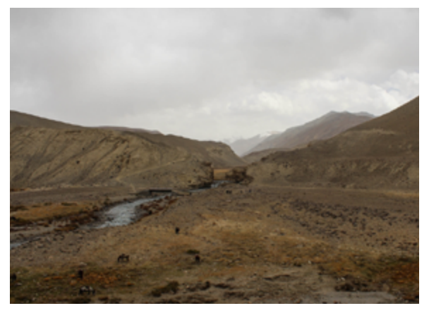
Tajik-Afghan border, Wakhan valley road, Gorno-Badakhshan

Border crossings along the Tajik-Afghan understandably sensitive. border are Because of the long-standing war in Afghanistan, greater controls have been placed on cross-border trade and relations. Smuggling and other criminal enterprises have sprung up in the region, and violence erupts regularly along the border. Westerners are strongly advised by their governments not to travel in this region. Most of the checkpoints between these two countries cross the Panj River, making crossings increasingly treacherous. 52, 53