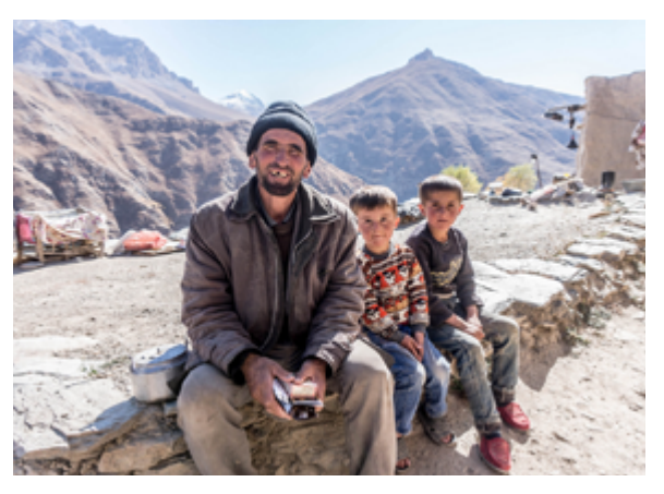
Yaghnobi man and his sons in the mountain village of Kirionte, Northern Tajikistan

Although ethnic Kyrgyz make up just 1% of the population, they are the third-largest ethnic group in Tajikistan. Ethnic Kyrgyz and Tajiks who live in the disputed border areas frequently quarrel over whether