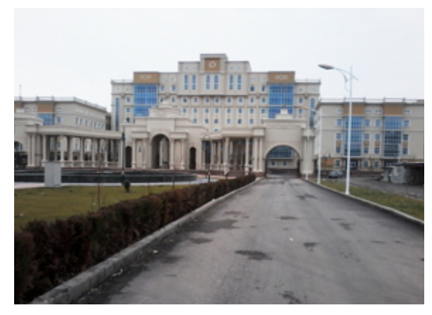
A hospital in Dushanbe

Although Tajikistan has achieved the status of polio free for 13 years, a serious outbreak occurred in 2010. In 2015, USAID donated oral polio vaccines to prevent another outbreak.<sup>13</sup> Medical care and supplies are far below Western standards and many hospitals and clinics reuse disposable medical supplies out of necessity. There is also a severe shortage of anesthetics, prescription drugs, and antibiotics. There have been outbreaks of hemorrhagic fever,