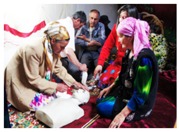
Training the local Emergency Response Team

Like many other services in Tajikistan, rural healthcare services fall below Western standards and, consequently, the majority of rural Tajiks lack access to basic healthcare. Economic devastation resulting from the civil war had severe effect on rural healthcare. Many rural areas lacked healthcare professionals, and people were required to travel to urban areas to seek medical care. The problem persists today, despite programs aimed at improving rural residents' access to healthcare