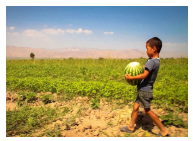
Child working in watermelon field

The pervasive poverty in Tajikistan makes it difficult for families to educate their children. Parents are often too poor to cover expenses related to education, such as buying shoes, clothing, books, and school supplies. Furthermore, in recent years, economic hardship has forced many rural men to migrate abroad to find work so the labor of children is required to help feed families. This situation creates a gender gap in the schools. When forced to choose, parents prefer to educate their boys rather than their girls.<sup>25, 26, 27, 28, 29, 30</sup>