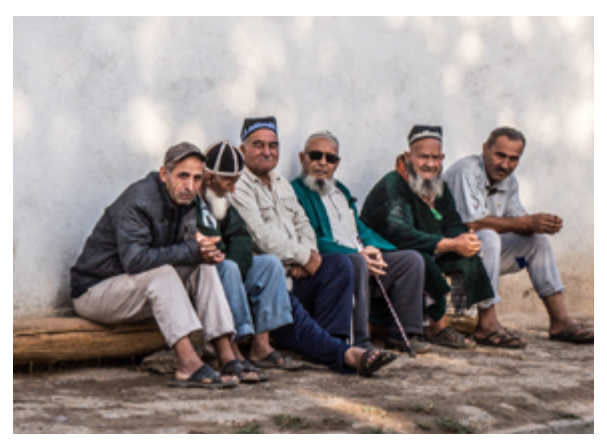
Tajik men wearing tupi

Men have also fallen under bans on facial hair. Tajik officials claim that long beards are an outward sign of Islamic radicalism and in some places they have issued regulations limiting access for men with beards. Schoolteachers below age 50 may