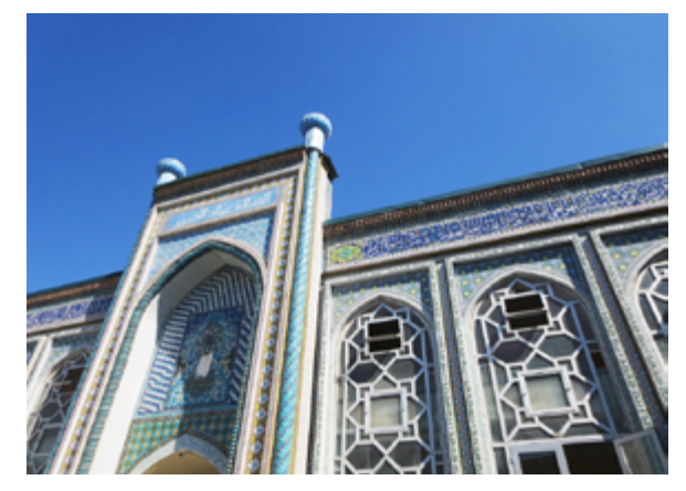
Central Mosque, Dushanbe

The small Jewish population in Tajikistan formerly had one synagogue, which was demolished in 2008 to make room for a planned presidential palace. In 2009, a building was donated to the Jewish community of Dushanbe to use as a synagogue.<sup>57</sup> Christian groups face difficulties in maintaining their buildings of worship. Only officially registered Christian groups are allowed to operate churches. Churches that operate without official status are closed down. Dushanbe's