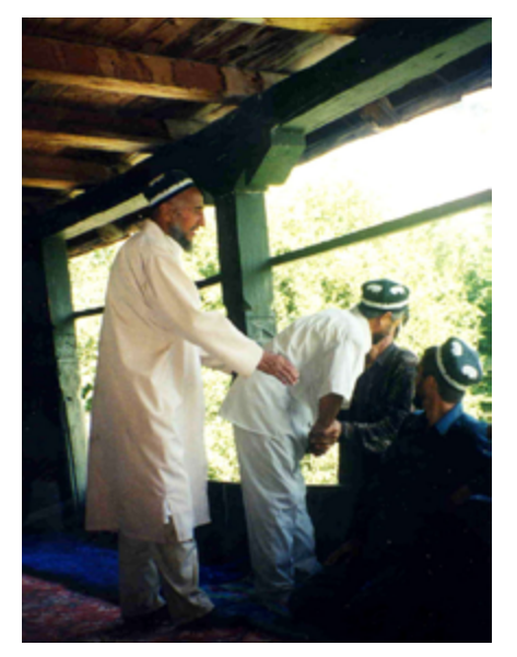
Tajik men greeting guests