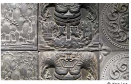
Paekche tiles, 7th century

Chinese forces of the Sui and Tang dynasties took part in these ongoing battles, waging attacks against both the Goguryo and Paekjae kingdoms. Goguryo won several spectacular victories against the Chinese forces but found itself weakened by the fighting. Silla forces routed them in 668, eight years after Paekjae had fallen in a combined attack by the Silla and Tang armies. After defeating Goguryo, Silla turned its military attention toward the Tang Dynasty. By 676,