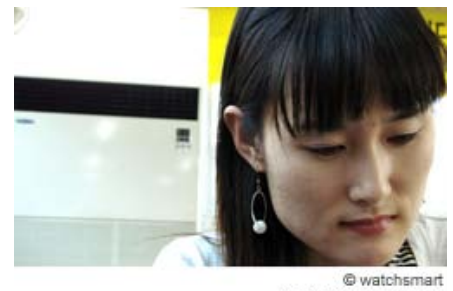
North Korean woman

higher percentage of housewives (70% by one estimate) than other socialist nations.<sup>329</sup> As the North Korean economy faltered and food rations that were provided at factory jobs became insufficient to feed families, women increasingly became vendors selling homemade foods or unneeded goods from the home—at unsanctioned markets that sprang up in towns and cities. In some cases, they became involved in small-scale service businesses, such as