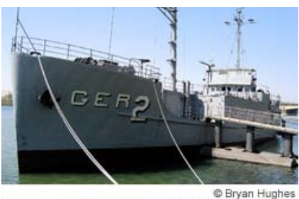
USS Pueblo docked in P'yongyang, DPRK

Kim II Sung increasingly felt threatened by South Korea's modernized military and security alliance with the United States and Japan. More money was allocated to defense spending, and by 1971 defense spending accounted for 30% of the national budget. <sup>161, 162</sup> North Korean attempts at subversion and infiltration across the DMZ, including a 1968 failed assassination attempt of South Korean President Park Chung Hee, increased during this period. In 1968, North Korea also seized the U.S.