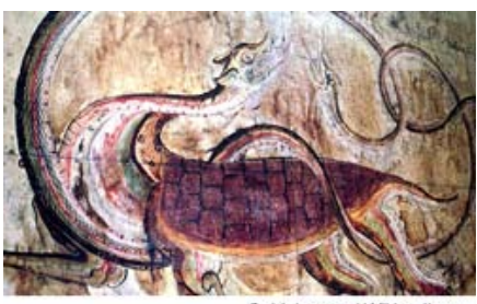
Shamanism in Korean history

The Period of the Three Kingdoms was one of remarkable political and societal changes on the Korean Peninsula. Powerful aristocracies developed around tribal chiefs who established themselves in the capitals of the kingdoms. The aristocrats were divided into classes of varying power and privilege based on societal position. In Silla, for example, the kolpum (bone rank) system based political power on bloodlines. Only those paternally descended from the Kim and Pak clans could enter the ruling elite.<sup>89</sup>