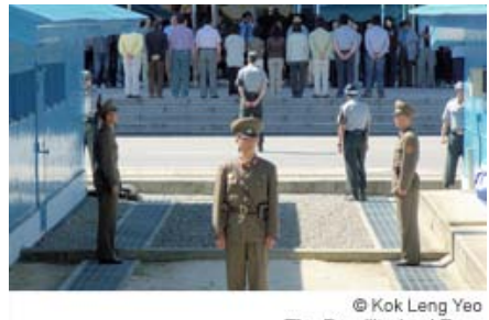
The Demilitarized Zone

The Democratic People's Republic of Korea (DPRK) and the United States have never had formal diplomatic relations. Between 1950 and 2008, the United States banned most commercial trade and financial transactions with the DPRK under the Trading with the Enemy Act.<sup>367</sup> In 1988, after two North Korean terrorists planted a bomb that blew up a Korean Airlines flight, the United States placed North Korea on the list of State Sponsors of Terrorism, where it remained until 2008.<sup>368</sup>