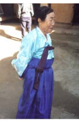
Woman in traditional dress

The traditional chosun-ot worn by women features two pieces. The jogori is a full-sleeved short jacket that is tied together in front by long ribbons. The cheema is a high-waisted, gathered wraparound skirt, usually worn long and full. Over the centuries, the woman's