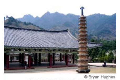
At a buddhist temple, Mt. Myohyang, DPRK

Even though the Constitution of the Democratic People's Republic of Korea (DPRK) provides for religious freedom, in reality the right to practice the religion of one's choice does not exist. Religious activity that takes place in North Korea is carried out within narrow confines allowed by the government. Some reports suggest that the North Korean regime has organized many of the country's sanctioned religious groups solely for propaganda purposes or