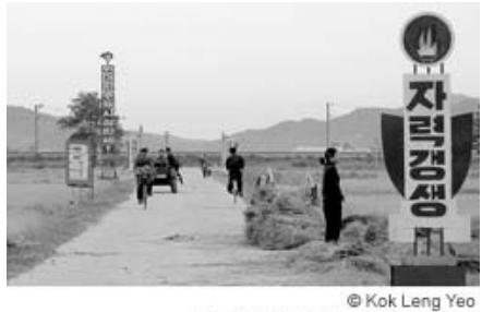
The Chonsam Cooperative Farm

Over the last two decades, North Korea has struggled to produce enough food to feed its people. In most years, imports and aid shipments of basic grains have been necessary to avoid famine conditions. A relatively good harvest in 2008 eliminated fears of a massive shortfall, but the country continues to remain only one bad harvest away from another food crisis.<sup>196</sup> Geography is certainly a significant part of the problem, as North