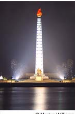
Chuch'e Tower, P'yŏngyang

Despite these limitations, several areas of certainty illuminate our knowledge of North Korea's people and their culture. For example, despite nearly 70 years of separation from their ethnic kin in the South, North Koreans continue to share many cultural touchstones with South Koreans, such as language, food, and artistic and historical traditions. Although North Koreans have moved away