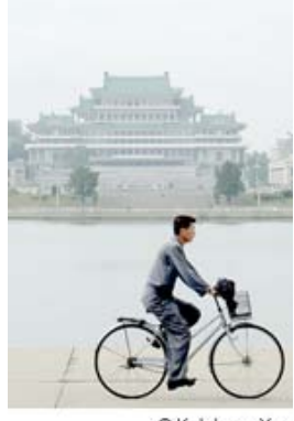
A bicyclist near the Taedong River

North Korea's mountainous geography limits transportation connections between the eastern and western sides of the country. A single east-west main rail line links Pyongyang to the country's eastern coast at Wonsan, from which a separate railway runs