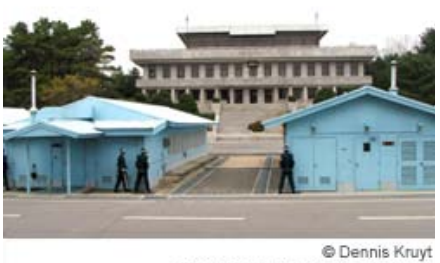
DMZ border North - South Korea

After World War II, the Korean Peninsula was divided between the North and the South at the 38th parallel. Since the end of Korean War hostilities in 1953, the boundary has been the military line of demarcation running down the center of the Demilitarized Zone (DMZ), a buffer of land between the two Koreas that is often described as the world's most militarized national boundary.<sup>1, 2</sup>