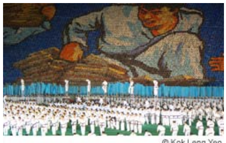
Karate performance created by school children

Despite the nation's reputation for isolating itself