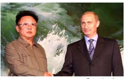
Kim Jong-II and Vladimir Putin

After taking power, Kim Jong II faced serious problems trying to revive the nonproductive North Korean economy. Famine conditions from 1995 to 1997 drew attention to the country's inability to provide basic necessities. Since 2002, modest economic reforms have been implemented. But the nation still suffers from a lack of outside investment and limited ability to carry out foreign trade to meet its needs. Despite its juche message of self-reliance,