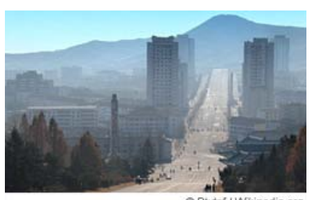
City center of Kaesong, North Korea

Originally founded as an administrative center early in the 20th century, Sinuiju's main function was to facilitate rail shipments destined for China. After the Korean War, the city was the site of a major uprising against the Korean Communist Party. Today, it is home to several important factories including the Rakwon Machine Complex, which provides most of the industrial equipment for the nation. Several defense and munitions factories are located in