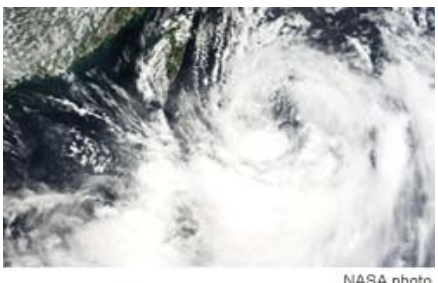
Typhoon Billis

Volcanic eruptions and earthquakes do not pose major threats in North Korea. The country's most devastating natural disasters involve extremes in precipitation: North Korea receives too much rain or not enough. During 1997, for example, food shortages reached famine proportions when summer rains materialized too late for most field crops.<sup>67</sup> The drought conditions that year were preceded by two years of heavy flooding generated by torrential rainfall; floods destroyed hundreds of thousands of