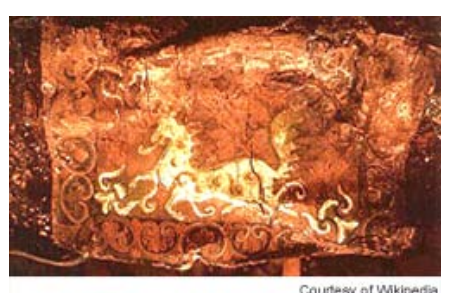
Cheonmado, only surviving picture of the Silla kingdom

South of the Han River, several villages formed three loose federations known as the Samhan. They consisted of Pyonhan in the south central region, Mahan in the southwest, and Chinhan in the southeast. The Samhan paid tribute to the Lelang commandery and traded iron with Chinese neighboring states.<sup>83</sup> For three or four centuries, three more centralized states (Paekjae, Kaya, and Silla) dominated and eventually absorbed the Samhan states.