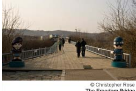
The Freedom Bridge

Between the invasion in June 1950 and the signing of the armistice in July 1953, millions of North and South Koreans were killed in fighting that spread to nearly every corner of the peninsula. In addition, more than 33,000 U.S. forces, fighting alongside the South Koreans, were killed, representing about 90% of the total deaths of UN forces. China, which supported the North Korean forces, lost hundreds of thousands of soldiers.<sup>150</sup>