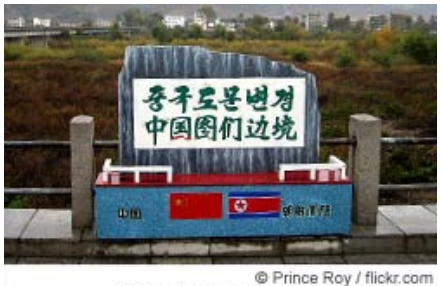
On the border of North Korea and China

China, which regards North Korea as the key to maintaining stability on the Korean Peninsula and in Northeast Asia, is a cautious ally. North Korea's insistence on continuing its rocket and nuclear research has placed the Chinese in an awkward position with the international community, but historical and economic ties make it unlikely that there will be any major changes in relations between the two countries.<sup>380</sup>