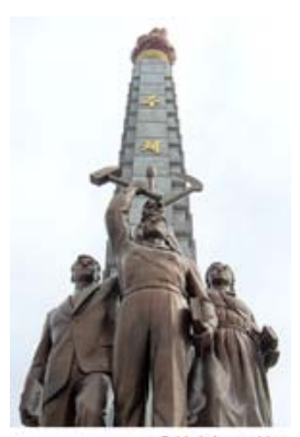
Tower of Juche Idea, P'yŏngyang

Today, Pyongyang is not only North Korea's governmental center, but it is also the nation's transportation hub. Roads and railways