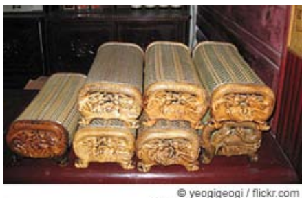
Consumer goods for export

Prior to the partition of the Korean Peninsula in 1945, northern Korea was the site of most of Korea's heavy industry, whereas warmer, less mountainous southern Korea was the center of agricultural production and light industries such as textiles. Northern industries were oriented toward processing raw materials and creating semifinished goods, which were shipped to Japan for final processing.<sup>186</sup> After the Korean War, during which