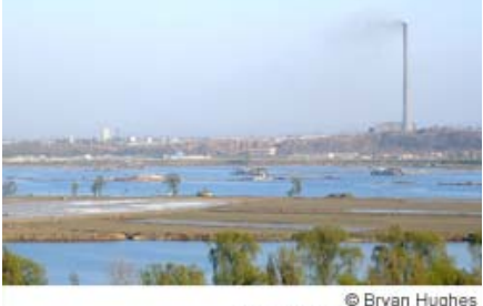
Bryan Hughes P'yöngyang coal power plant

vacant. The pyramid-shaped hotel, the most striking landmark on Pyongyang's skyline, sat vacant and unfinished for 16 years until Orascom resumed work on it in 2008. Estimates in the South Korean media have suggested that it may take as much as USD 2 billion to complete the hotel and make it safe for use.<sup>245, 246</sup>