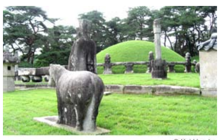
Tomb of King Sejong

A high point of the early Chosun period was the reign of King Sejong (1418–1450). This was a time of political stability and economic prosperity, highlighted by numerous cultural and scientific achievements. During this time the first Korean alphabet, Hangul , was developed; prior to its introduction, the Korean language could be written only by using Chinese characters ( Hanja ), a difficult process for most people. In addition, during Sejong's