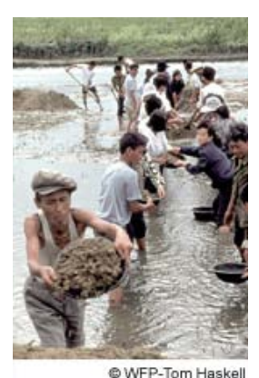
North Koreans receiving food aid

Arguably, the food emergency between 1995 and 1998 brought more wrenching changes to the nation than any other event in North Korea's history. This period of famine brought the public system of food distribution to a standstill.<sup>426</sup> As a result, private farmers' markets sprang up in urban areas, where nonsubsidized food was either purchased with cash or obtained through barter. With little to lose, many North Koreans also began to ignore tight governmental travel restrictions. An unprecedented wave of North Koreans migrated across the Chinese border, some for only temporary periods before coming back with goods or income from China.<sup>427</sup> In response, the DPRK government set up a number of detention facilities designed to hold those caught traveling without a permit.<sup>428, 429</sup>