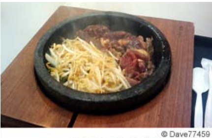
Bulgogi, a favorite Korean beef dish

Rice is North Korea's staple food, served at most meals either alone or with other grains. Panchan (side dishes) may accompany the rice. The most ubiquitous panchan is kimchi, a dish Koreans usually make with pickled cabbage. Southern varieties of kimchi are known for their spiciness, but in North Korea, kimchi is not as heavily flavored with salt or red pepper.<sup>318</sup> It is more likely to include fish.<sup>319</sup> Other spices and vegetables such as radishes, mushrooms, turnips, and