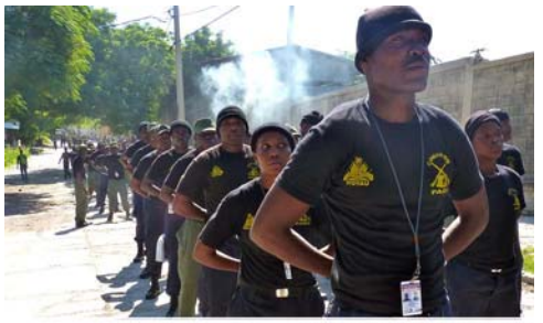
Haiti's new Army recruits

Haiti was born of revolution in 1804, and its first leaders were military heroes. Haitians, constantly fearful of losing their hard-fought freedom to another international power, supported leaders who ruled on the strength of their personalities and military prowess. Yet throughout the 19th century, the army continually undermined the central government, while armed insurgents dominated the countryside.<sup>431</sup>