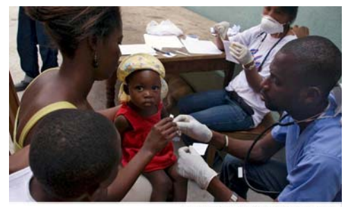
Cuban doctor treats patients

Following the Cuban revolution of 1959, Cuba encouraged revolutionaries in nearby countries, even if