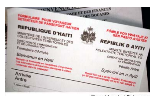
Custom forms, French and Creole

French has historically been the language of the ruling class, while Haitian Creole is the language of everyday