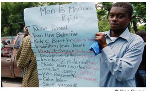
@ Ben Piven List of government enemies

The World Bank has stated that government corruption in Haiti is severe and pervasive, existing in all branches and at all levels of government.<sup>455</sup> Embezzlement, misuse of government funds, and bribery are long-standing problems.<sup>456</sup> Anti-corruption laws are largely ignored in Haiti, which has no transparency laws requiring the government to make documents public. Although government officials and civil servants are required to declare their assets to the Financial Control Information Office, only 10% comply, and those who do not are not