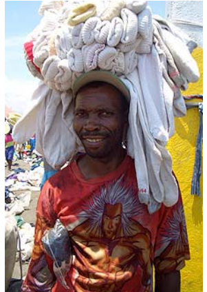
Haitian man selling pepe

Tourism in Haiti dropped dramatically from its peak in 1980 after rumors surfaced that the AIDS virus had originated on the island.<sup>287</sup> (AIDS was introduced into Haiti by Americans, but, with one of the highest infection rates outside Africa, Haiti is still plagued by this stigma.)<sup>288</sup> Political instability in the last 30 years has also discouraged tourism.<sup>289</sup>