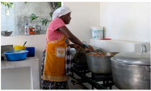
Preparing a meal

Meats are often marinated with herbs, spices, and citrus juices or vinegar, then stewed and fried (a useful technique for tougher cuts of meat).<sup>361, 362</sup> The dish is usually served with a peppery sauce on the side.<sup>363</sup>