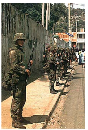
US military presence 1994

In terms of national security, the illegal immigration of Haitians to the U.S. has been a long-standing problem between the two countries.<sup>413</sup> During the years of military rule after Aristide's first departure in 1991, the U.S. intercepted more than 100,000 Haitians attempting to enter the