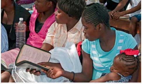
Bible in Creole

Haiti's earliest literature celebrated the nation's birth. Hoping to convince foreign readers that the violence of the revolution was part of the natural evolution of human society based on Enlightenment ideals, Haitian writers copied French essays, poetry, and plays to produce works that were nationalistic and romantic, especially in their portrayal of Haiti's revolutionary heroes.<sup>380, 381</sup>