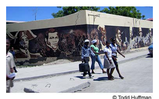
Mural celebrating independence

Nearly all present-day Haitians are descendents of West African slaves brought to the island by French and Spanish colonists. Society in what is now Haiti has been highly stratified since the arrival of the Spanish at the end of the 15th century.<sup>324</sup> At the top of the social order during colonial times was a small ruling class of white Europeans who owned large plantations and held top government positions. At the bottom of the social order were large numbers of African slaves owned by the Europeans, who grew wealthy from agricultural exports.