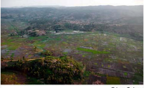
Haiti rice fields

The coastal Plaine du Nord, the site of the island's first French settlements, lies between Haiti's north coast and the Massif du Nord.<sup>14</sup> The area is mostly agricultural, but—as the location of the slave insurrection that led to