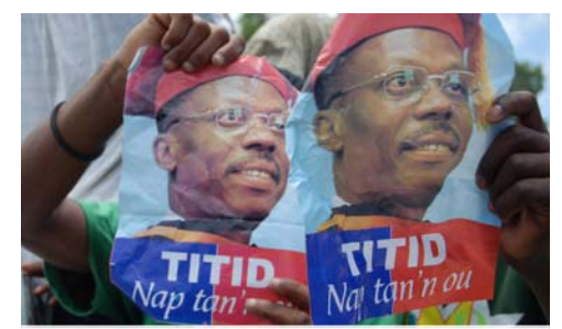
© Ben Piven Aristide supporters rally

Aristide was constitutionally barred from serving a second consecutive term; René Préval, Aristide's former prime minister and hand-picked successor, was elected president in 1995-the first peaceful transfer of power in the history of the Haitian republic.<sup>209</sup> But over the next five years, Aristide actively undermined his former protégé by splitting the Lavalas Party, the political party Aristide had created. Foreign aid slowed as the deadlocked legislature failed to pass required reforms.<sup>210</sup>