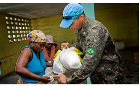
Receiving food rations

The worldwide rise of food prices has been devastating in a country in which the majority of the population lives on