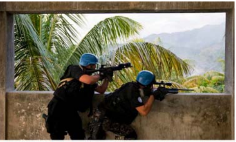
MINUSTAH drug exercise

Haiti is a major transit point for drugs moving through the Caribbean to the United States and Europe. It is estimated that about 8% of the cocaine entering the United States annually transits Haiti, whose long coastline and land borders are largely unpatrolled. Drugs are dropped offshore by speedboats from Columbia or brought by planes that land on clandestine airstrips in the mountains. Drugs also enter Haiti via container ships and Haiti's land border with the Dominican Republic.<sup>448</sup>