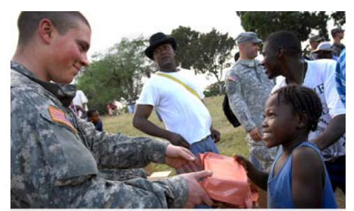
US military aid

Motivated by moral and strategic imperatives of national security, the U.S. military entered Haiti to provide humanitarian aid and to repair infrastructure after the devastating January 2010 earthquake.<sup>403</sup> The country's strategic proximity to Cuba, Central America, and the Panama Canal—as well as its political, economic, and social ties to the United States—are key contributors to its importance to U.S. national security.<sup>404</sup>