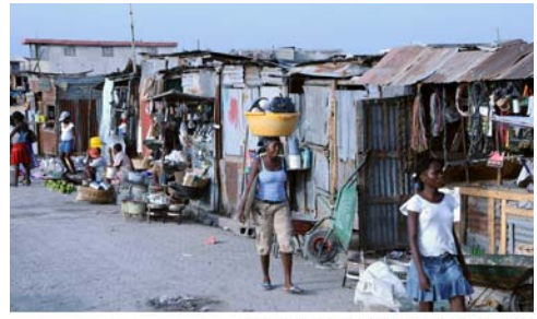
Slum life in Cite Soleil

Port-au-Prince, established on the Gulf of Gonâve in 1749, replaced Cap-Haïtien as the capital of Haiti in 1770.<sup>44</sup> Building styles resemble those in New Orleans, another former French colony, but earthquakes, hurricanes, and other disasters have damaged much of its