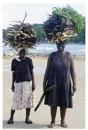
Gathering wood for fuel

The government created a national electricity company, Electricité d'Haiti, in 1971 to generate and distribute electricity. In 2006, 70% of Haiti's electricity was produced from imported diesel fuel, and 30% was generated from the Péligre Dam, which currently functions at 50% of capacity because of mechanical problems and the silting up of the Artibonite River.<sup>270, 271</sup> Four thermal plants near Port-au-Prince supply