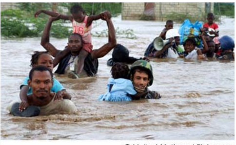
Hurricane "Ike" rescue

When floods destroy houses and wipe out harvests, Haitians have few resources to fall back on, and the government is often slow to respond to their needs.<sup>477</sup> Haitians often lose their savings and livelihoods in these