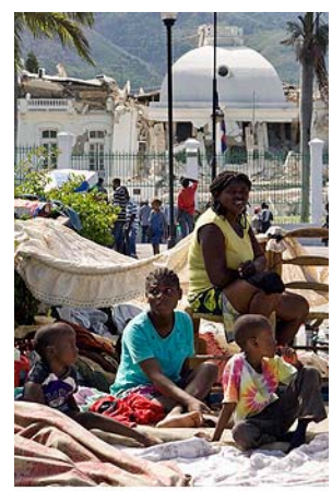
Earthquake survivors

Elections scheduled for February 2010 were delayed until November 2010.<sup>231</sup> Charges of election fraud led to rioting after the primaries, and a runoff election was called for early in 2011.<sup>232</sup> Pop musician Michel