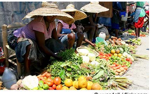
Women selling at market

Women in Haiti are often called poto mitan , after the pole in the center of Vodou temples that represents the tree of life. Women are responsible for raising the children and keeping house for their husbands, who are expected to work to provide for their families.<sup>367</sup> Yet a growing number of Haitian households are headed by women, making them responsible for the financial well-being of the family.<sup>368</sup> Compared to other countries in the region, Haitian women generally work more outside the home.<sup>369</sup>