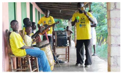
C Thomas Hack Haitian music

Haitians signal the beginning of a story by calling out "Krik?" If the audience wants to hear the story, it responds with "Krak!" Folktales in Haiti are often dark, but they also reveal the Haitians' wry sense of humor.