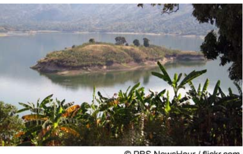
Guayamouc River

The Artibonite River is Haiti's longest river, running 400 km (250 mi) through central Haiti from the Dominican border to the Gulf of Gonâve.<sup>33</sup> Completed in 1956, the Péligre Dam was built on the river as part of a large-scale irrigation project in the Artibonite Valley. The reservoir created by the dam, Lake Péligre, is Haiti's second-