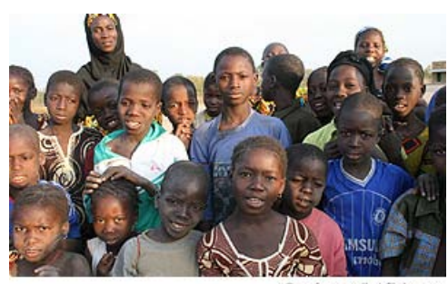
School childrer

The short-term prediction for Mali's economy is modest growth, as long as the agriculture, construction, and mining sectors continue to operate without problems. <sup>131</sup> Profits from growth are consumed by a national deficit that is financed with foreign aid. Corruption is a serious problem that eats into the funds targeted for development, and may reduce the future amount of aid offered. <sup>132</sup>