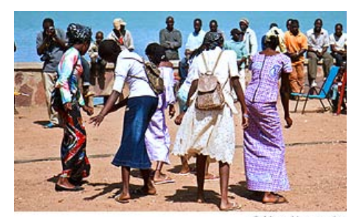
© Mary Newcombe Young girls dancing at festival

Traditional music, song, dance, and drama are on radio and television and at frequent festivals. Performers may wear huge masks or operate large puppets, or play traditional instruments like the balafon , a type of gourd xylophone; stringed gourd instruments such as the kora and dossongoni ; drums, and reed flutes. <sup>212</sup> Mali's national dance troupe tours internationally. Musicians of world renown include Oumou