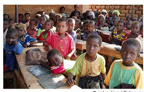
Village school children

Equal educational opportunities for all are a challenge for Mali. The national education budget has fallen since 2007 due to decreasing international aid. Public funds go disproportionately to secondary and higher education, which is concentrated in Bamako. <sup>206</sup>