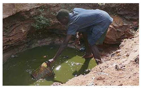
Conventional faecal pit

Prolonged dry seasons and rising temperatures are contributing to the expansion of the Sahara southward into the Sahel region. Human adaptations to these climate changes, such as migration from rural to urban areas, are contributing to environmental degradation. This includes increased deforestation near population centers where firewood is the main energy source. Intensive farming has depleted and eroded soils, and overgrazing has converted Sudanic savanna