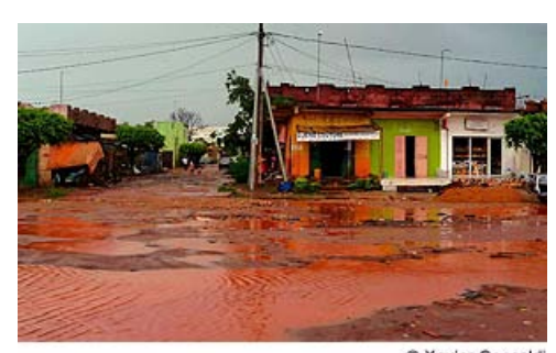
Muddy trail, Mali

The yearly cycle of rainfall combines with annual temperature changes to produce three seasons. The weather is dry and hot from February to June, wet and relatively mild from June to November, and dry and cooler from November to February. These weather patterns produce three climate zones in Mali. The northernmost Saharan zone has almost no annual rainfall with mean daily temperature highs of 48°C (119°F) and lows of 5°C (41°F). In the Sahel, the continent-spanning