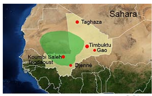
DoD Image Location of the Ghana Empire

The Soninke empire of Wagadu may have arisen in the fourth century C.E. and was well-established by the seventh century in the area of the upper Senegal and Niger rivers (along the present border with Mauritania). Later historians called the kingdom Ghana, using the Soninke term for "king," ghāna . The rulers of Wagadu collected tribute from their subjects. They also taxed the production of gold in the south, and the trade of salt and other items from the north. In