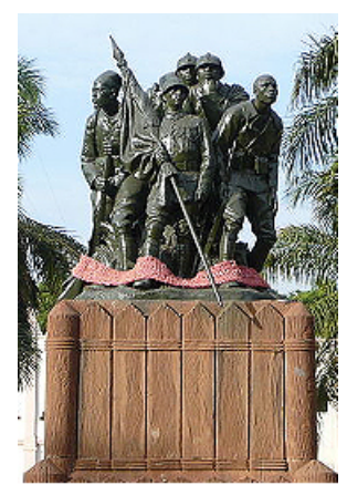
Monument of Heroes, Bamako

As the former colonies were separating from France, they were also changing their relationships with each other. Competing notions of national, regional, and pan-African governance arose. In 1958, the Mali Federation was proposed with a membership of the Sudanese Republic, Upper Volta (present-day Burkina Faso), Dahomey (present-day Benin), and Senegal. Upper Volta and Dahomey dropped out before the federation became active in early 1960, and Senegal withdrew from the federation in August 1960. <sup>60, 61</sup>