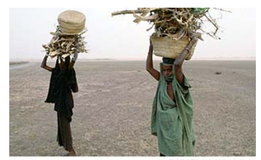
Women collecting firewood

More than 75% of the population lacks electricity. Ref. The Manantali Dam, a project of the Organization for the Development of the Senegal River, provides Mali, Mauritania, and Senegal with hydroelectricity. But the project has also