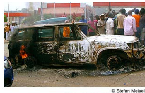
UN car torched in Côte d'Ivoire

Côte d'Ivoire is a major trade partner, a source of electric power, and home to as many as half a