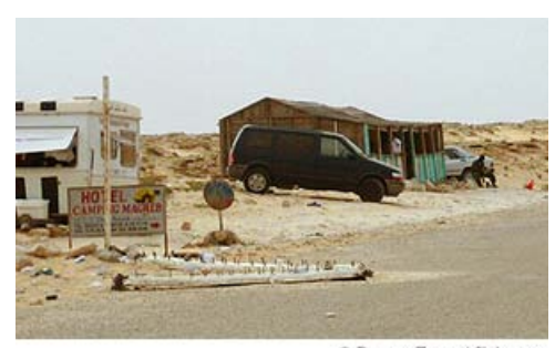
Border crossing, Mauritania

Mauritania shares Mali's longest border, over 2,200 km (1,400 mi). Its population is 70% Maure and 30% other peoples, including the Haalpulaar (Fulani), Soninke, and Wolof. Tensions between the North African Arabic Maure and other Mauritanians of sub-Saharan origins led to the expulsion of non-Maure peoples to Senegal in 1989–1991. An estimated 5,200 remain homeless. Mauritania is distant from West Africa in other ways—for example, it does not share a common