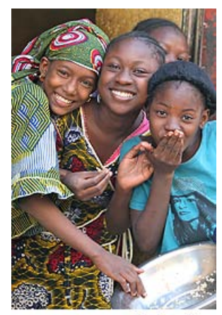
Young girls, Mopti

Most of Mali's ethnic groups recognize at least three traditional social classes: an elite nobility, a large working class, and an underclass of slaves. <sup>182, 183, 184</sup> Many people further divide the intermediate class into ranked occupational specializations or