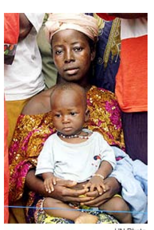
Refugee at a camp in Guinea

Guinea shares an 858 km (533 mi) border with Mali to the southwest, through Sudanic savanna. The headwaters of the Niger and the Senegal rivers enter Mali across the Guinea border. A road from Mali to Guinea was built in 2005. <sup>252</sup> Fulani and Malinke peoples make up the majority of the population in the country. Guinea was the only colony to refuse membership in the liberalized French Community in 1958. It has been largely independent of its regional neighbors. For example, Guinea does not belong to a regional monetary union nor is its currency backed by France. A coup in 2008 led to the suspension of much foreign aid, and flawed presidential elections in 2010 featured Fulani and Malinke groups fighting each other. Legislative elections scheduled for 2011 have yet to be confirmed. <sup>253</sup>