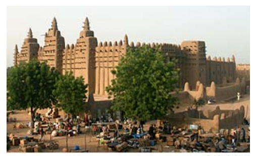
The Great Mosque, Djenné

Djenné is the oldest known city in sub-Saharan Africa. Remains of the original trading center, Jenne-Jeno, date from 250 B.C.E. The current city, on an island at the meeting of the Niger and Bani rivers, developed in the 11th century. A key hub of the gold and salt trades, the city was conquered by the Songhai, Fulani, and Tukulor peoples, and occupied by France. This UNESCO World Heritage site is best known for its Great Mosque, the world's largest adobe building,