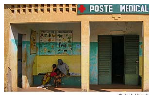
Rural clinic, Blendio

Medical care is limited and concentrated in urban areas. Even in regional capitals, hospitals lack equipment. A lack of safe drinking water and sanitation contribute to the high percentage of deaths from communicable diseases. Traditional healers including male and female herbalists, diviners, and shamans are found throughout the country. Their local knowledge of treatment with medicinal plants often helps their clients. 205