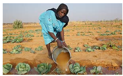
Woman watering garden

Mali is a model for developing democracies. It maintains diplomatic and economic relationships with its regional neighbors and continental friends. Likewise, it maintains amicable relations with its former colonizer France and the European Union. It retains connections with its Cold Warera mentors Russia and China. It has also forged new links with its current partners in global counterterrorism, including the United States. It was able to accept international arbitration to