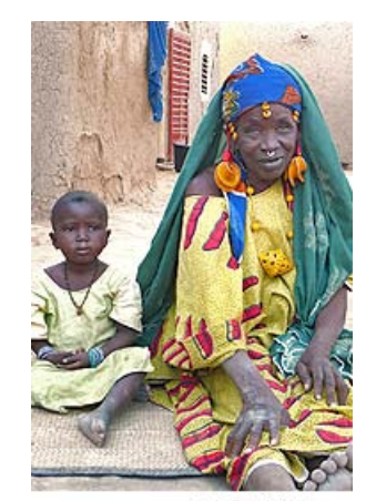
Grandmother and child

Ibn Battuta, the 14th-century Arab Muslim writer, observed that women of the ancient Mali Empire were immodest in dress and independent in behavior. Though one might make similar observations today—for example, Muslim Malian women do not veil—their fathers, husbands, and a patriarchal society control Malian girls and women. By civil and Islamic law as well as