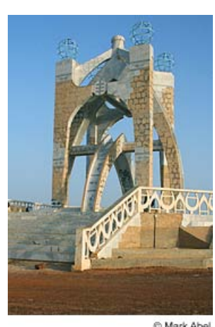
© Mark Abel Monument commerating Tuareg Rehellion

Civil war in Algeria between the government and Islamic rebels in the 1990s was followed by relative stability under a permanent state of emergency in the early 2000s. The 2011 situation is troubling: food riots and political protests are recurring, and North African neighbors Tunisia, Libya, and Egypt are in upheaval. Al-Qaeda in the Islamic Maghreb (AQIM) originated in the insurgent groups who fought the Algerian Civil War. Algeria, which is anxious for Mali to contribute to the suppression of AQIM in the northern Sahara, sent equipment in 2009 and formed the Joint Military Staff Committee with Mali, Mauritania, and Niger in 2010. The United States is also