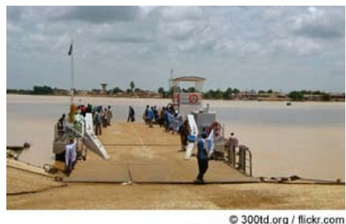
Border crossing, Senegal

Senegal was briefly half of the Mali Federation, an attempt in 1958 to create a pan-African state