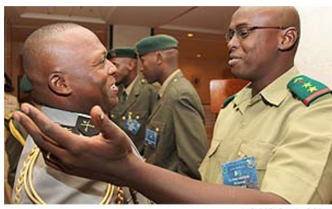
Africa Endeavor planning conference

West African attitudes toward military and law enforcement are "frosty," so the United States may undermine its goal of supporting counterterrorism if a military approach is too heavy-handed. Many analysts argue that the best road to security is one of social and economic development. Mali is trying hard to promote its social capital—kinship, compromise, consensus—as a basis for peaceful democratic development. Investing in its social capital may be the path to securing Mali's future.