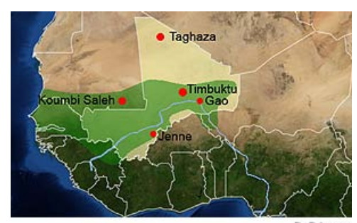
Location of the Mali Empire

The Malinke people settled the city of Kangaba, on the upper Niger River east of the Futa Djallon massif near the Guinea border, from the ninth century. <sup>28, 29, 30, 31</sup> The Malinke became traders in gold, subject to the Wagadu and Susu kings who ruled Kangaba until the 13th century. A Malinke of the Keita clan, Mari Djata, revolted against the Susu king Sumanguru, and defeated him at the battle of Kirina (near present-day Bamako) in 1235. Djata became known as Sundiata Keita, the