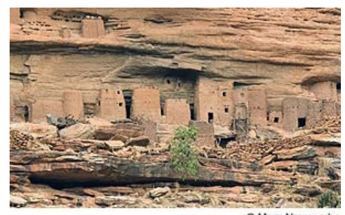
Mary Newcombe Dogon village on side of mountain

Near the center of the country is Hombori Tondo (1,155 m, 3,800 ft), Mali's highest point. Also in this region is the Bandiagara Plateau and Escarpment (Land of the Dogons), where humans dwell in sandstone cliffs that rise to 1,000 m (3,300 ft). From the southwest border with Guinea, the Futa Djallon Massif extends into the Mandingue Plateau. This diverse region has highlands up to 640 m (2,100 ft), and contains deep river valleys.<sup>2</sup>