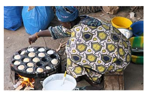
Martha de Jong-Lantink Woman cooking

Cooked grains—traditionally millet, corn, sorghum, or more recently rice—are the staple of the Malian diet. The grain may be prepared as a porridge or a doughy pancake. It is typically served with a sauce made from plants, such as leaves, onions, or okra, or with a protein such as peanuts or fish that is dried, then smoked or