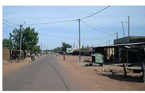
Border of Mali and Burkina Faso

Burkina Faso borders Mali for about 1,000 km (620 mi) on its south central side. Senufo, Bobo, Fulani, Mande, and Dogon peoples live on both sides of the border. The countries have resolved a lengthy border dispute and become significant trade partners, although the main trade route from Mali's capital Bamako to Ougadougou in Burkina Faso is infamous for excessive bribery. Burkina Faso's borders and airports lack formal tracking mechanisms and are considered a security issue by the United States.