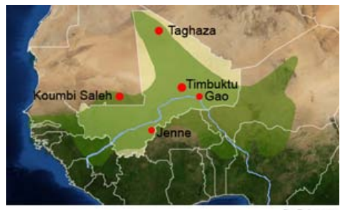
Location of the Songhai Empire

The Songhai people lived at Gao, near the northeastern bend of the Niger River, from the ninth century. <sup>36</sup> Gao became capital of their kingdom in the 11th century. The kingdom grew to include Timbuktu, and for a time was part of the Mali Empire. In the 14th century, the Songhai rulers founded the Sonni dynasty. A century later, their leader Sonni Ali Ber brought the Songhai Empire to greatness during his rule from 1464 to 1492. Ali battled the Mossi and later the Tuareg at