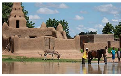
Bwawere Region, Segou

Segou lies on the Niger River halfway between Bamako and Mopti. It was an important trade center and the capital of the 18th-century Bambara kingdom. It is now a regional capital and the third-largest city in Mali. It houses the headquarters of the Office du Niger, which manages the agricultural water resources from the nearby Markala dam. Segou is noted for its Sudanese colonial architecture, pottery, and cloth markets.