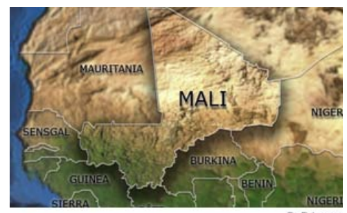
Map of Mali

Mali is a large, relatively flat and arid country in West Africa. At about 1,240,000 sq km (479,000 sq mi), the landlocked nation is nearly twice the size of Texas, and slightly smaller than its eastern neighbor, Niger. The Sahara in the north and the Niger River in the south shape the country's ecology, history, economy, and society.