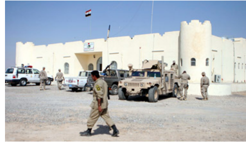
Syrian / Iraqi Border

Syria's largest border problem exists along its 724-kilometer (450-mile) stretch of boundary with Iraq, which has been called "the fastest-growing humanitarian crisis in the world," because of the Iraqis crossing into Syria to escape instability in their own country. 276 In addition, U.S. officials claim that some of the wealthy Iraqi refugees arriving in Syria are helping to finance the insurgency against the U.S. forces in Iraq. In May 2004, the United States placed economic sanctions against Syria because it believed that Syria had failed to stop terrorists from crossing its borders and was thereby undermining efforts to stabilize Iraq. Border guards may be driving vehicles that are easily outrun by people who cross illegally. 277