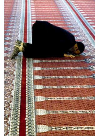
Man praying, Umayyad Mosque

All religions must register with the government and get approval for their buildings of worship. In March 2011, the government closed down eight churches in the country for meeting in what they referred to as “house churches.” Generally, places of worship must be built as a separate facility. Converting an apartment and turning it into a place of worship may not be allowed under current regulations. 131