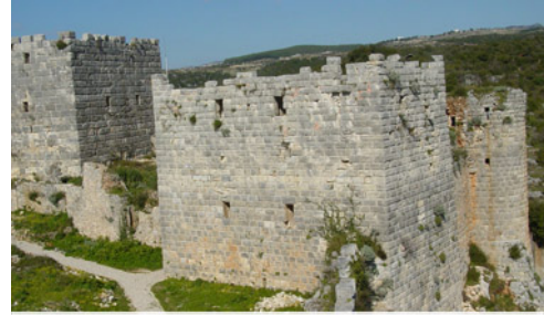
Ruins, Syria

When the right to travel to holy sites was restricted by Turkish conquerors, Christian armies invaded from the West. The first Crusade (religious military campaign) was launched in 1095 by Pope Urban II, and the crusaders occupied Syria in 1098. The Syrians fought back. Resistance and resentment against the invading crusaders was strong throughout Muslim lands for centuries to follow. The powerful leader Saladin fought the crusaders and united Syria and Egypt. After his death, however, unity was fractured and Syria became vulnerable to other conquerors. It was not until 1302 that the last crusaders left Syria. 100, 101