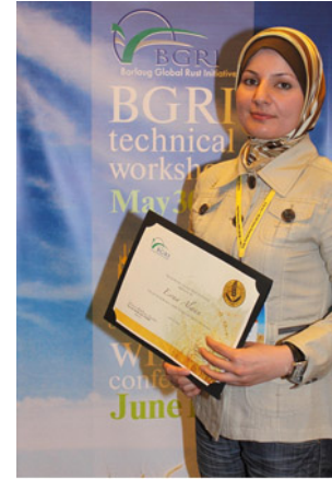
Syrian woman receiving award

Syria ranks 79th out of 123 nations in incidence of discrimination against women based on property rights, family rights, physical safety, and civil rights. Yet it would be inaccurate to think that Syrian women simply stay at home and raise families. 296 More women have served as heads of state in Muslim countries than in the West. 297 In Syria specifically, many women serve as government officials or are active in business. 298 They have excelled in the education, engineering, and legal fields. 299 Women in Syria also work as journalists and are seen unveiled on TV. Despite such gains, however, the overall rate of female participation in the labor force is relatively low. In 2001, only about 21% of the labor force was women. 300 By 2006 that number increased to only 27%. 301 The majority of Syrian women, as in the Middle East in general, stay at home if married and are responsible for the care of the family.