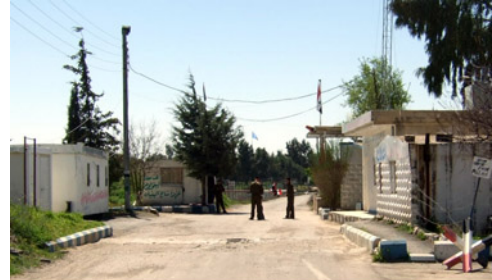
Checkpoint, Golan Heights

When stopped at a checkpoint, showing identification is compulsory.