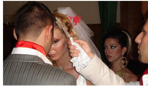
Wedding, Aleppo

It is common for Christians to marry in a church. Friends and relatives are invited to the wedding ceremony. After the wedding ceremony, friends and family gather, along with the bride and groom, at a reception. 168