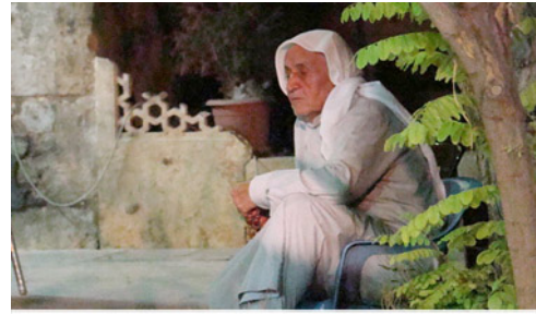
Elderly man, Syria

Because many members of a family may live together, they remain connected through daily interaction. The elders are respected within this network and are usually not placed in nursing homes. 294 Rather, the family will try to ensure that a family member can take care of them. Throughout old age, the grandparents or great-grandparents remain fully integrated members of the family and are consulted for their wisdom and experience. The ideal is for all family members to remain emotionally and physically close throughout their lives.