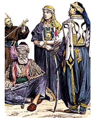
19th century Syrian clothing

In 1500 B.C.E., the region was conquered by Egyptians and then by Hebrews and Persians. Alexander the Great (of Macedonia) swept through in 330 B.C.E. Syria was part of the Roman Empire from 64 B.C.E. until the Arab Conquest in 636 C.E., when Islam was introduced. The 12th century brought the Christian Crusaders to Greater Syria. The Kurdish warrior Salah al-Din al-Ayubi, known in the West as Saladin, led the Muslims to defeat the Crusaders and take back their cities. Then, in 1260, Mongols invaded Syria, weakening the country. 31