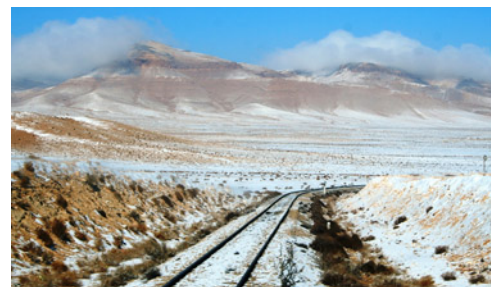
© Josh Hough Cold Syrian Landscape

Syria's climate is dry, and temperatures range from extremely hot to freezing cold. During the summer (June to August or mid-September), the interior is hot and dry and coastal areas may be humid, with moderately warm temperatures. In the desert, summer temperatures rise to 43°C (110°F). Visitors to this area should take precautions to avoid heat exhaustion. In the mountains, summer temperatures are usually mild. Spring and autumn are considered the best times to travel. Flowers are in bloom and temperatures are mild. Occasional rain in the coastal areas and in the mountains during the spring tends to keep the air clear. 5