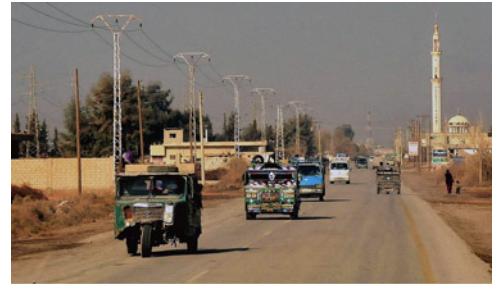
Rural transportation

Although reaching some rural areas can still be difficult, in recent years Syria has expanded its road network and transportation system in these regions. Many roads now have asphalt paving. 253 Nevertheless, about 77,911 kilometers (48,411 miles) of roadway remain unpaved. 254 The bus system spans most of the country and is frequently used to reach rural destinations in Syria. 255