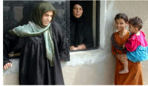
Iraqi refugees, Damascus

Syria has one of the largest urban refugee populations in the world. 193 Refugees are mainly from Palestine (approximately 557,000) and Iraq (1.2 million). 194 The Iraqi refugees have been entering Syria more than any other country in the region since the beginning of military operations in Iraq in 2003. 195 Syria has traditionally allowed other Arab nationals visa-free entry into the country. However, in 2007 Syria required Iraqis to obtain visas before entering. Since 2008, the Syrians have strictly enforced entry visa requirements and have rejected record numbers of applicants. 196