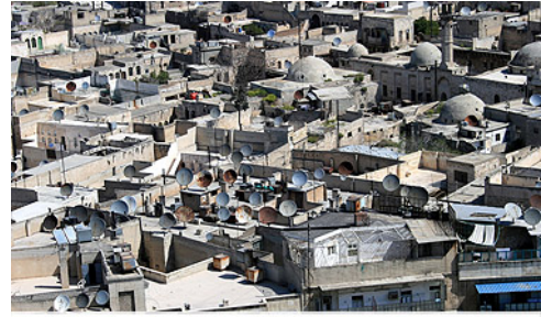
Satellite dishes

Freedom of speech in Syria is limited. All publications are controlled by the government. The people are sheltered from outside influences that would make them question the regime. In 1999, Syria began providing internet service, but e-mail was available only to people in certain occupations. Although internet cafes are now springing up in the cities, content is greatly filtered. 55