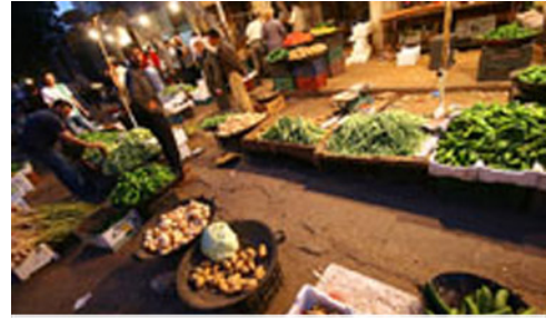
Market, Damascus

Most Syrian cities contain modern malls and the traditional souks . These are covered markets that have been in operation for centuries. Maze-like streets are abuzz with merchants and buyers mingling until late in the evening. In many cities, souks specialize in certain types of merchandise, such as a spices, gold, and so on.