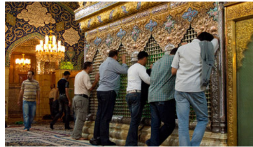
Men praying, Ruqayya tomb

Islam is a religion practiced through living one's life in accordance with the laws of Allah (God) as set forth in the Quran. Islam was founded by the Arab prophet Muhammad in the 7th century C.E. Muhammad, it is believed, received revelations from Allah while meditating in the desert over a 23-year period. Soon after Muhammad died, Muslims split into two sects. The Shi'a preferred naming religious leaders from descendants of Muhammad's family. They believe that Ali, the prophet's cousin and son-in-law, was the Muslim community's rightful leader. The Sunnis, however, favored electing religious leaders. Sunnis eventually became the dominant Islamic group in Syria.