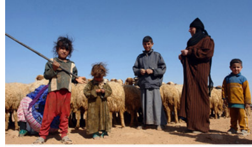
Syrian Family

A typical household may consist of parents, children, grandparents, and other relatives, all living under one roof or in households located nearby. This extended family configuration is found more in rural areas than in urban areas, where the families under one roof may be smaller but still live close to relatives. After marrying, a couple, particularly in rural areas, typically live with the husband's family, rather than set up a separate household.