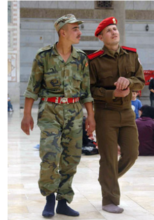
Syrian soldiers in mosque

In 2010, a new office of religious affairs was created in the Syrian Prime Ministry. The office banned veiled women from entering the country's universities. The office also banned religious