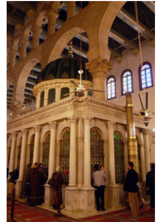
Tomb of John the Baptist

Churches in the Christian quarter of Damascus represent the various Christian denominations of Syria. One church, St. Paul's Chapel, is