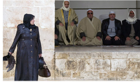
Umayyad Mosque, Aleppo

The majority of visitors who pray at the shrines of saints are women, especially in rural areas. One reason for this may lie in the exclusion women experience in the formal practice of religion. For example, women must worship in separate areas of mosques. Many women will visit a mosque only when in bad health or in times of great need. Deeply traditional practices such as praying at shrines of saints are passed on from one generation to the next. 117