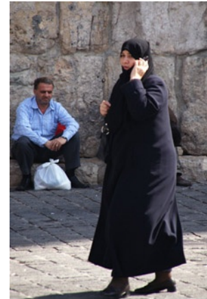
Woman using cell phone

There is an increasing number of Wi-Fi enabled internet cafes, especially in Damascus. People can also go to internet shops and pay for internet use by the hour. The lack of available broadband connections leads to slow connections and lengthy downtimes. Promises of broadband services suggest such service may be available in the near future. 214