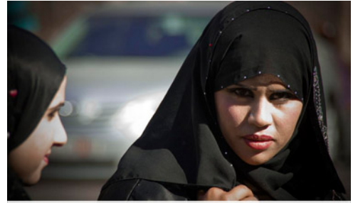
Woman in hijab

Bedouins, about 5 to 10% of the population, seldom follow their previously nomadic existence. 77, 78 By the 1950s, they largely stopped guiding desert caravans because of decreased demand for such services. When the Assad Dam was built on the Euphrates River in the 1960s, many Bedouins worked on the dam and were thus introduced to a cash economy. 79 After that, they were less likely to return to a pastoral or nomadic life. 80, 81