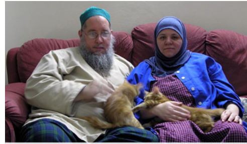
Family, Damascus

The contemporary family in Syria, despite some changes, looks much the same as it did in generations past. Families remain connected, often living in extended households. Numerous factors—including urban migration, housing shortages, economic pressure, more women working outside the home, and higher levels of education—have reduced the size of the family. 283, 284, 285 Still, the family remains the core of Syrian society, and traditions within the family remain strong. The extended family is seen as a stable, secure place where family members may return when necessary.