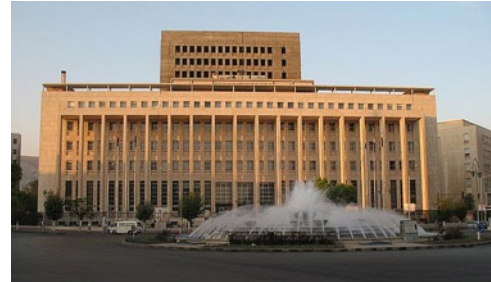
Central Bank of Syria

The banking system in Syria has long been state-owned. Although state ownership is changing gradually, banks are still highly centralized and subject to government controls. The Commercial Bank of Syria (CBS), for instance, is the only bank allowed to exchange money. Branches of the CBS are present in all major towns. Regulations for transactions vary at different branches of the CBS. Some charge a commission for changing money and others don't.