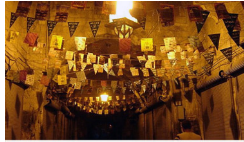
Ramadan flags

Most of Syria's religious holidays and festivals revolve around Islamic holidays. Minority groups also celebrate their special occasions with enthusiasm. Many Muslim celebrations center on the five Islamic pillars of faith, which are the testament of faith ( shahadah ), praying five times daily ( salat ), the pilgrimage to Mecca ( hajj ), fasting during Ramadan ( sawm ), and giving alms to the poor ( zakat ).