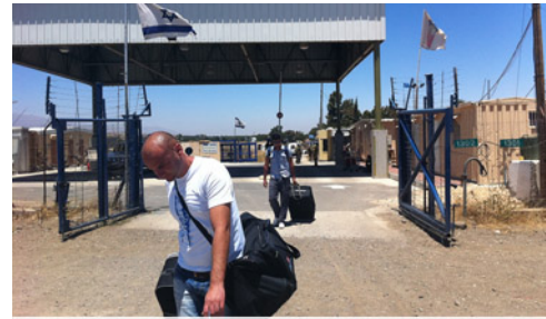
Syrian / Israeli Border

Border control is an issue faced by every country. Syria’s rugged terrain makes much of its borders with Turkey, Jordan, Lebanon, Israel (including Golan Heights), and Iraq difficult to oversee. Syrians’ own perceptions of national identity could affect border negotiations. Syria exists more as a geographical rather than national entity, although shared identity as Arabs does unite much of the population. But because the Syrian population is made up of groups based on ethnicity, religion, and socioeconomic background, the country lacks a unified sense of nation that is typical of many democracies,