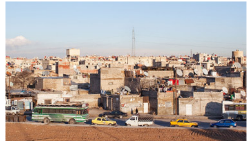
© Anobel Odisho Jaramana Refugee Camp

The 2003 Iraq war has caused Iraqis and Palestinians fleeing violence to seek refuge in Syria. The country accommodates nearly 14% of the world's refugees. 87 Nearly 2,000 refugees pour into Syria monthly. Most come from Iraq and Palestine. Additional refugees from Somalia, Afghanistan, and other countries also arrive. The refugee population puts increasing strain on the economy of the country and creates social problems as well. Finding proper food, shelter, education, and medical help is difficult. 88