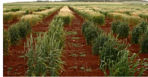
Crop, Halab

Men in rural communities also may work in the construction industry. Craftsmen are hired to build homes, install plumbing and electrical lines, or lay tiles. These skilled workers often earn reasonable wages. 240 Serving as an apprentice with a skilled craftsman can be the route to this kind of livelihood.