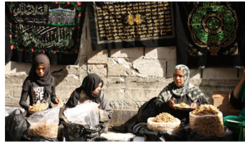
Syrian women at market

These days, most men work in the service sector (21%) with construction (18.2%) and industry (17.7) not far behind. Women, on the other hand, work primarily in the service sector (56%) followed by agriculture (23%). Only 8.7% of women are employed in the manufacturing sector. 140 Although women have traditionally been underrepresented in the business sector, this is beginning to change. More and more women are taking a leading role in family companies compared with even 25 years ago. 141