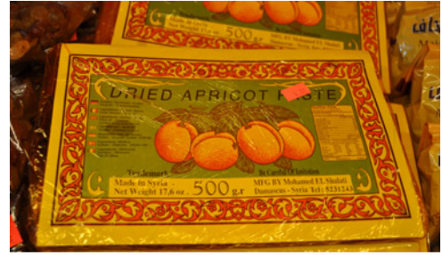
Syrian apricot paste

Syria's largest export partners are Iraq (30%), Lebanon (12%), Germany (9%), Egypt (7%), Saudi Arabia (5%), and Italy (4.5%). Syria's major exports include petroleum, fruits and vegetables, wheat, cotton, textiles, clothing, meat, and live animals. 70