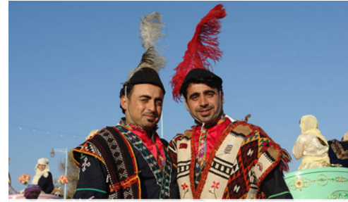
© Charles Roffey Men dressed in traditional dress

Political holidays celebrate the nation’s independence and accomplishments. These holidays include Revolution Day (8 March), which marks the Baath Party’s ascension to power in 1963; Independence Day (17 April), which marks the end of French rule in Syria in 1946; Martyrs’ Day (6 May), which honors Syrians who fought the Ottomans in World War I; Correctionist Movement Day (16 November), which celebrates the government overthrow that resulted in Hafez al-Assad’s rise to power is celebrated; and New Year’s Day (1 January), which is an official holiday. 160