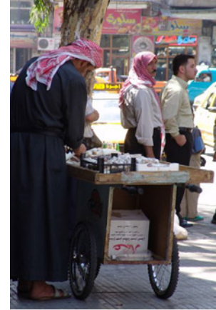
Street vendor, Hamah

Some vendors, both on the street and in the souks , can be quite persistent when trying to make a sale.