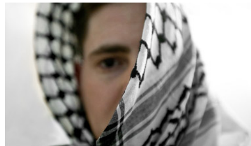
Houran Bedouin woman

Men can initiate divorce more easily than women. They may, for instance, divorce on grounds of adultery, an occurrence that would be difficult for women to prove as reason for initiating a divorce. Nevertheless, there are reasons for which women are allowed to seek a judicial divorce in Syria: for example, if the marriage was not consummated, or the husband is absent for a period of time, or if there is extreme discord or abuse. 312, 313