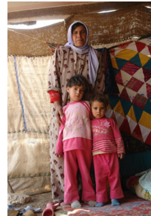
Syrian mother and children

Children are valued because they enlarge the family and bring increased social standing. Before the age of 5 or 6, not much is expected of children. Their behavior is generally widely indulged. However, their status in the family, as they grow older, often depends on economic circumstances. In rural areas, older children are often taken out of school to work on the family farm. In comparison, children of more stable or middle-class families are encouraged to continue their education. 295