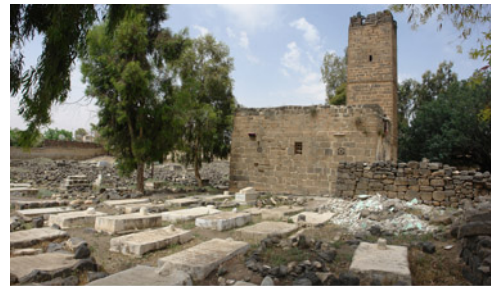
Cemetery, Damascus

Funerals include parting rites that accompany the moment of death and mourning for the deceased. In the parting rites, a prayer leader or holy man attends to the dying person and reads scriptures. The death is followed with rituals to express mourning and respect for the dead. These rituals include a vigil, funeral procession and services, burial, condolences, and a funeral meal. The funeral banquet is held after burial in Christian communities, and one week after a death in Muslim communities.