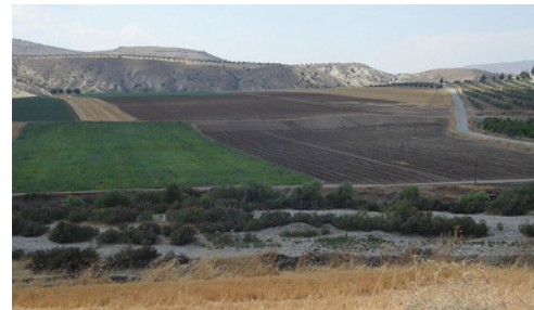
Aleppo, northern Syria

Since ancient times, Syria's main agricultural region has been part of the Fertile Crescent. This arc of land stretches from Iraq through western Syria and into Egypt. It is where settled farming (agriculture) began 10,000 years ago. Major Syrian cities, such as Damascus, Hamah, Homs, and Aleppo, are found within the crescent. Its rich soil leads some to believe that it is the "Garden of Eden, the biblical home of Adam and Eve." 11 Some of the earliest of the Middle Eastern civilizations—including the Sumerians, the Babylonians, the Hebrews,