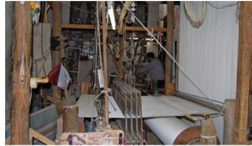
Ancient Loom, Hamah

Syria's economy is based on oil, mining, textile manufacturing, and agriculture. Syria's economy has been socialist since 1958. Following the discovery of large oil fields in the 1980s, the Syrian government formed partnerships with foreign companies—including ConocoPhillips and Shell Oil—to build and operate oil refineries. In addition to allowing some economic privatization, a new investment law issued in January 2007 reduces administrative procedures, allows foreign investors to export more of their profits, and otherwise provides incentives for investment in Syria. 57