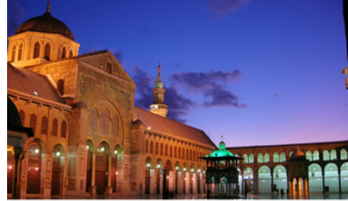
Umayyad Mosque, Damascus

Syria has no official state religion, although the constitution states that the president must be Muslim and that shari'a (Islamic Law) is a principal source of legislation. Syrians are predominantly Muslim. The Islamic religion in Syria is divided into different sects. There are also non-Islamic religious groups, including Christian sects. Although there are minor tensions between groups, ethnicity probably plays a bigger role than religion in the tension. Religious freedom, which the government is increasingly striving for, is thought to contribute to the peaceful relationships among the diverse populations of Syria. 90