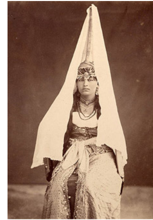
Druze woman 1870

The religion of the Druze originated from Shi'a Islam but is not recognized by many Muslims, as the Druze have a view of Islamic structure and practice that is contrary to the mainstream. 96 They worship al-Hakim, who disappeared in 1021, as their religious leader. The Druze believe that al-Hakim was the earthly presence of God, and that he will return to bring about a future golden age. They are known to be fiercely independent and secretive about their religious practices. They neither marry outside their faith nor admit new members. The Druze mostly live in the southwestern district of Jabal al-Arab. 97