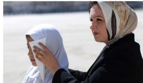
Teacher examining student eyesight

The government has established measures to increase and improve the medical services in poorer, less-populated regions. One such project mandates that physicians, pharmacists, and dentists who do not plan to specialize must practice for two years in rural areas after they finish medical school. 257