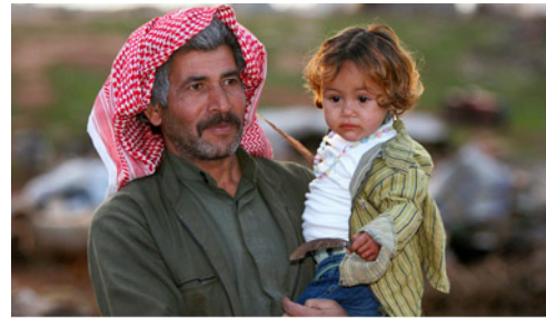
Syrian father and daughter

When naming a child, the family name is very important. 320 Both sons and daughters will take the husband’s family name. The child’s first name, which is the personal name, may be followed by bin (meaning “son of”) or bint (meaning “daughter of”). So, the name Jamila bint Muhammad would translate to Jamila, daughter of Muhammad.