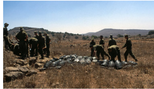
Laying and removing landmines

As of 2010, Syria had not signed on to the Mine Ban Treaty. Syrians are believed to have last used mines in 1982. As a result of Arab/Israeli wars, much of the Golan Heights are mined. There are an estimated 500,000 unexploded landmines scattered throughout the area. These mined areas are not mapped and only partially marked. Soil erosion and landslides further compound the problem by causing the landmines to shift to new areas.