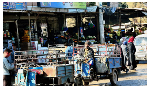
Busy streets, Dayr az Zawr

Women in rural areas have fewer options for working outside the home than those living in urban areas. In the country, the primary role of women is usually to care for the household and the children. A woman may bear ten or more children and have little time or energy for work outside the home. Women who have menial jobs also help in the fields, Men generally take care of livestock and do the main field work, such as planting and harvesting. 243