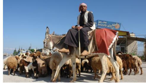
Sheppard watching his flock

Syria has a long cultural tradition. In general, Syrians place a high value on family, religion, education, self-discipline, and respect. Although Syrians tend to value identification with their religion, because the majority of the country are Sunni Muslims, strong feelings toward cultural unity also exist. 133, 134