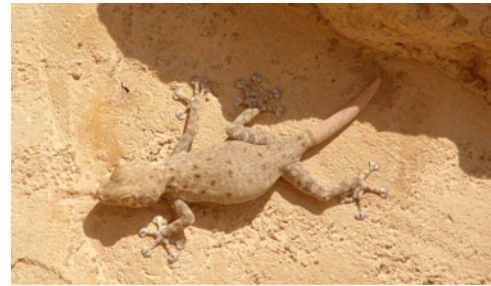
Spotted fan-footed gecko

Plant and animal life in Syria has greatly changed over the years. Forests were once plentiful along the coast, but most have been heavily cleared. 16 In some areas, lime, yew, and the zinober (fir trees) predominate. Elsewhere, the natural landscape has been transformed by agriculture. In ancient Syria, elephants and lions roamed the plains, but most wild animals were hunted nearly to extinction by the early 1900s. Some remote areas of Syria may harbor small numbers of wolves, wild boar, jackals, badgers, deer, and bears. Snakes and lizards can be found in the desert. Pelicans and flamingos live in marshy coastal areas. 17