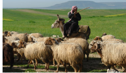
Houran bedouin

Farming is the main livelihood in Syria's rural areas. About 95% of the farms are privately owned, although the government controls where goods can be sold and the transportation system for shipping goods to market. 236