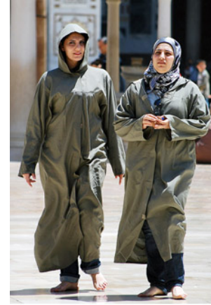
Women dressed to enter mosque

Religion is prominent in the daily lives of Syrians. There are mosques throughout the country, and they are well attended. When Hafez al-Assad was in power, he had hundreds of mosques built. On Fridays, the Muslim holy day, shops are usually closed, and crowds of people attend the mosques. The Muslim call to prayer is chanted five times a day from the minarets (towers) of mosques, and people pray facing in the direction of Mecca in Saudi Arabia. Non-Islamic churches, including Protestant, Catholic, and Anglican, are also well attended. In the Syrian Orthodox Church, members often celebrate mass in the ancient Aramaic language.