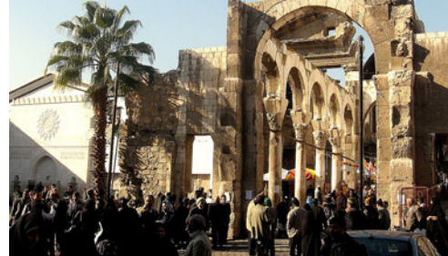
Roman Temple of Jupiter

Syria—an important and influential country in the Middle East—sits at the juncture of Africa, Asia, and Europe. Syria’s history dates back many centuries and covers the avenues and crossroads of commerce and religion. Both the ancient Silk Road between the Mediterranean and China and the Pilgrim’s Road to Mecca pass through Syria. Although the country’s population is 86% Muslim, the ancient Semitic language of Aramaic—in which parts of the Hebrew Bible are written—is still spoken. 1