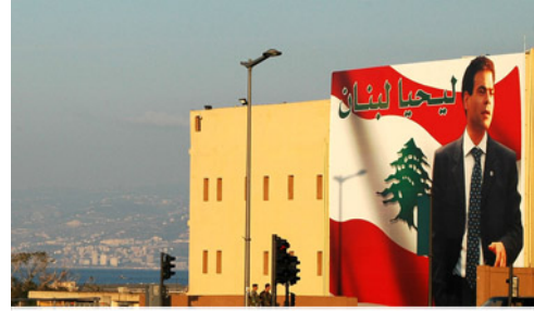
Pierre Gemayel

In 2001, Syria withdrew most of its 25,000 troops from Beirut but kept them in rural areas. However, after former Lebanese Prime Minister Rafik Hariri was assassinated on 14 February 2004, the UN ordered all foreign troops to withdraw from Lebanon. By the end of April 2005, Syria's 29-year occupation of Lebanon ended. 46