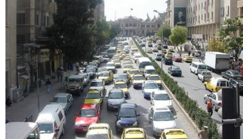
Urban streets, Damascus

Most Syrian cities still have an old (or ancient) part of town that includes businesses and residences. Souks (markets) offer food, crafts, and other goods for sale, just as in the past. Many people participate in the preparation, manufacture, or sale of this merchandise. Modern-day craftsmen may come to souks to sell their handicrafts such as clothing, jewelry, decorative items, blown glass artifacts, and leather products. This economy, however, is changing with the advent of technology.