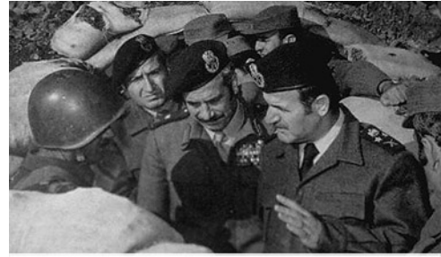
President Hafez al-Assad

Syria is a centralized republic in which the president has broad powers and citizens have limited rights. The constitution, adopted in 1973, establishes government control over the national economy. Voters must be 18 years of age or older, and citizens of voting age can elect the president. Their choice is narrow, however, for presidential candidates must be Muslim and nominated by the Baath Party. The president—elected for a seven-year term—commands the army and appoints the vice-president, the prime minister, and high-ranking government ministers. Most high-level decisions in Syria are made by the president and his appointees. For instance, the president has the power to declare war, change the constitution, issue laws, and appoint people to military positions. 51, 52