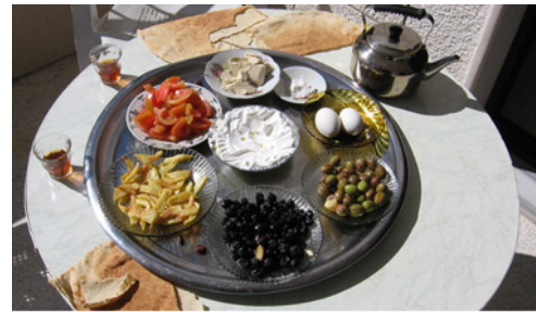
Syrian Breakfast

When the meal begins, guests should accept as much food as possible. Saying “no thanks” can be seen as offensive to the host. 154 Food should be eaten with the right hand, never the left, which is considered unclean. Soft food may be scooped up with flatbread, or food may be grabbed with the hand, rather than a spoon or fork. People may also eat while seated on the ground or the floor.