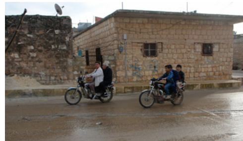
Houses, rural Syria

There are differences in the design and construction of rural and urban houses. 251 The courtyard of a rural home tends to be used as a garden for the household. It is surrounded by rooms on one or more sides, and bordered by a wall. The house is split into two areas: one for the people living there, called the mastabo , and one for their animals, called the zribeh .